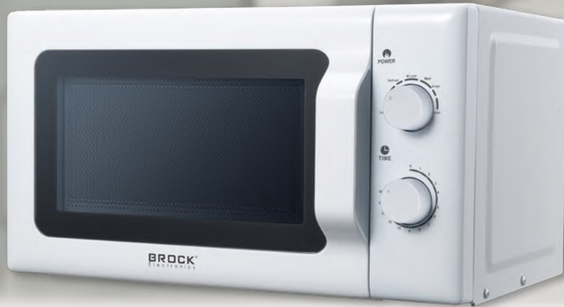
MWO 2001 WH