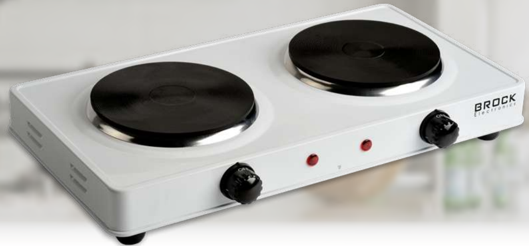
EP 200 WH

Power input 1000W; 220-240V, 50/60Hz | Hotplate with a diameter of 15.5cm | Ideal for college dorms, cottages or camping | Continuously controlled thermostat | Indicator light | Protection against overheating | Anti-Slip feet | Size: 22,4x 22,4cm |