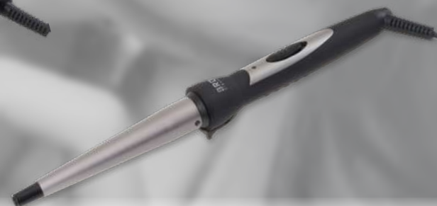
HC 1325 BK