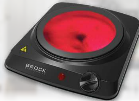
HPI 3001 BK

Power: 1800W | Single-zone | Suitable for cookware with a diameter up to 20cm | Touch sensor control | Extra durable & Easy to clean ceramic crystal glass surface | Temperature setting range: 50 - 500°C | Large LED display | Hot surface warning | Flexible timer |