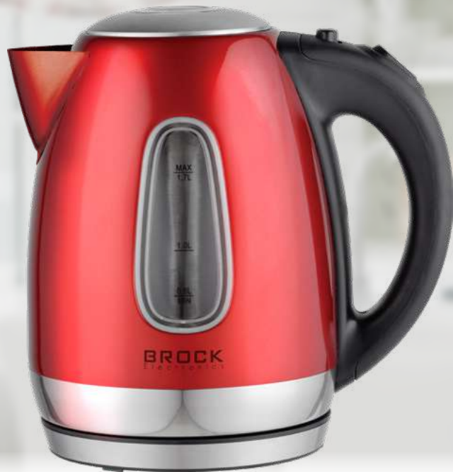
WK 06 RD