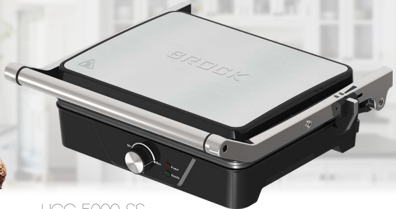
HCG 5000 SS

Power: 1500W | Cool touch handle | Drip tray for collecting excess oil | Adjustable temperature control knob | Height control knob for cooking various food easily | Non-Stick coating | Can open to 180° and use as an open grill | Power indicator light: Red, Readiness indicator light – Green | Skid resistant feet | Stand upright for compact storage |