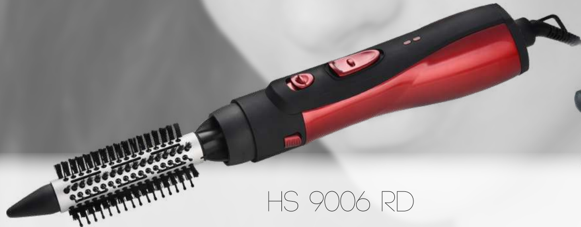
HS 9006 RD