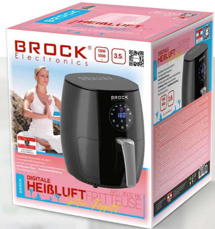
AFD 3502 BK

Volume: 3.5L | Power: 1300-1500W | Digital display for easy use | Thermostat: 80-200°C | Emits less odours and no more burnt oil | Quick, healthy and economical food preparation with no or little amount of oil | 60 minute timer and 6 pre-set programmes | Non-stick coating for the inner basket makes cleaning easy | Overheating protection | 220-240V~, 50/60Hz |