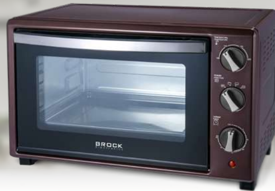
TO 3001 P