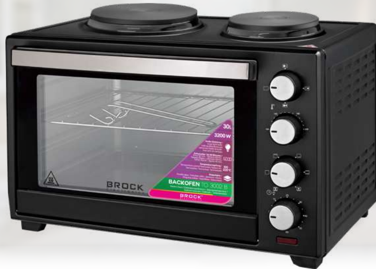
TO 3002 B