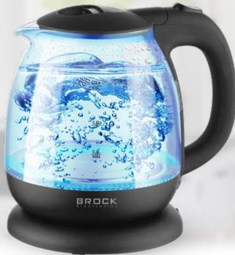
WK 2108 BK