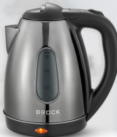
WK 0605 GY

Volume: 1,8L | Power: 1500W | Stainless steel body | Water level mark. Red indicator light | Triple safety system: Protection against overheating when turned on without water, Automatic shut-off when removed from the base, Automatic Shut-Off when boiling point is reached | Sunlight controller | Length of the power cord: 0,75m |