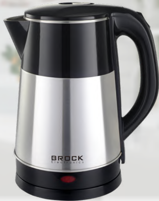
WK 8122 SS