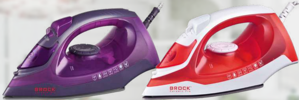
BSI 2010 PL