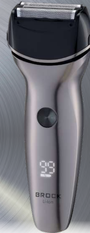
BMS 2002 GY

Wet / dry operation | Easy and convenient in use | Rechargeable battery: 600 mA | Charging time: 90 minutes | Operating time: 60 minutes with a single charge | Cable length: 180cm | Power: 5V, 100-240V, 50-60Hz | Accessories: Protect cap, Cleaning brush, Charger adaptor, Storage pouch |