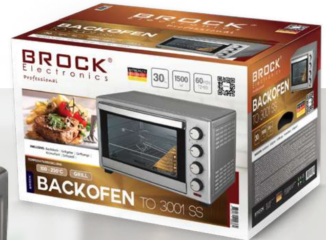
TO 3001 SS

Volume: 33L | Power: 1500W; 220-240V, 50/60Hz | Stainless steel design | Stainless steel heating element | 60 min timer with alarm | Thermostat 100-230°C | Heating functions: Off / Heating from top / Heating from bottom / heating from top and bottom | The large interior lighting | Double glass | Convection function | Rotisserie | Stainless steel handle | Accessories: Baking tray, Wire rack, Tray handle |