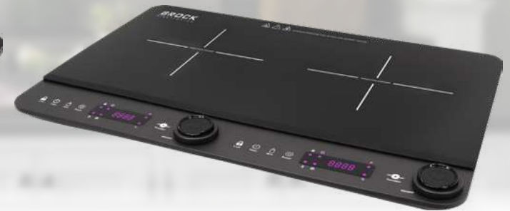
HP 5004 GY

Suitable Cookware Diameter 12-26 cm | Time regulation: 1 – 180 minutes | Temperature regulation: up to 240°C max | 7-Level Safety System | Touch and Knob Control Panel | With an easy-care A grade crystal glass | Overheating and surge protection |