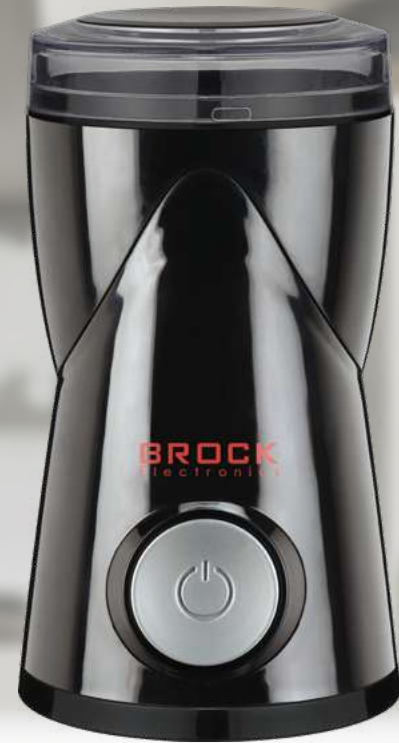
CG 3250 BK

Power: 150W | Capacity: 50g | Safety lock system | Stainless steel blade |