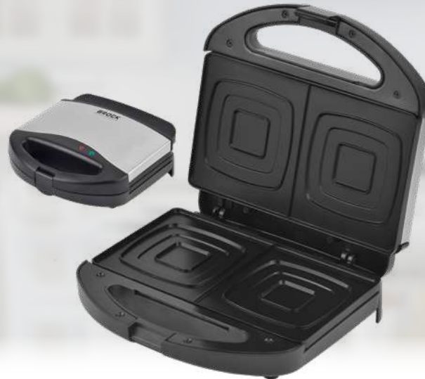
SPM 3006 S