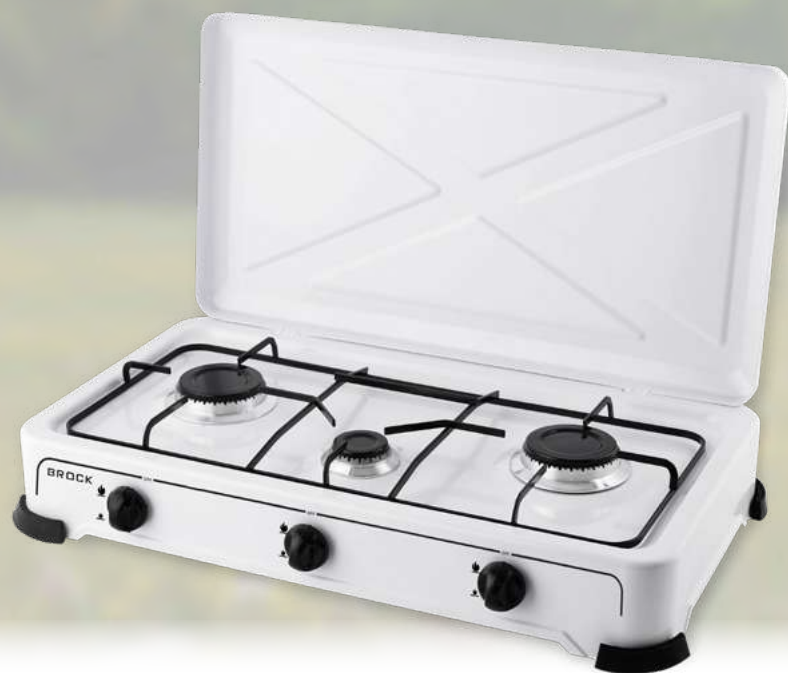
GS 003 W