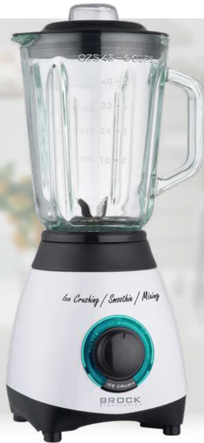
BL 1501 WH