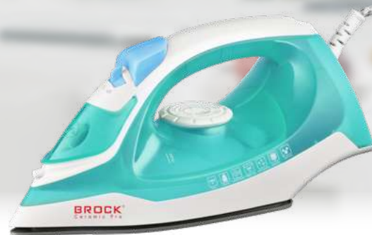
BSI 2013 AZ