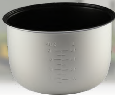
IP 1003 NSC

Capacity: 3L | For MC 1003 Multicookers | 0,9mm thickness | Single sided Non-Stick coating |