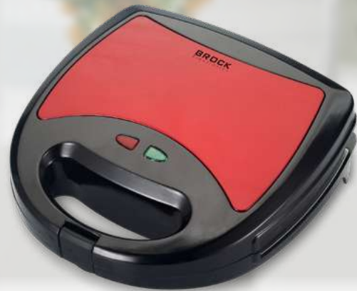
SSM 2003 RD