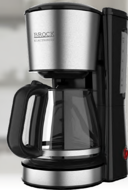
CM 1522 SS

Power: 915-1080W | Volume: 1,5L | Stainless steel holder and base |