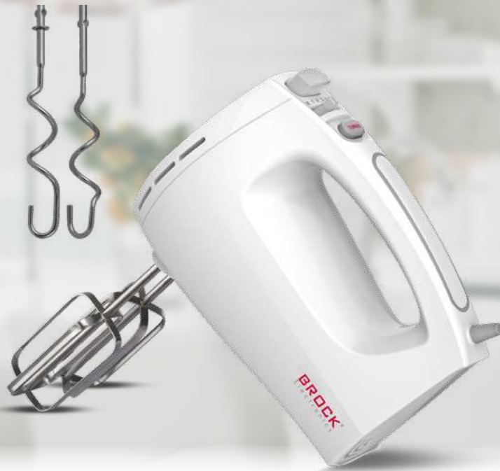
HM 3001 WH

Power: 300W | 5 speeds | TURBO function | Eject button for releasing attachments | With stainless steel beaters and hooks |