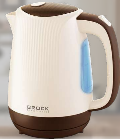
WK 08 BG

Volume: 1,7L | Power: 1850-2200W | On / Off switch | Water level mark | Triple safety system: Protection against overheating when turned on without water, Automatic Shut-Off when removed from the base, Automatic shut-off when boiling point is reached | Central 360° connector | Power cord storage in the base |