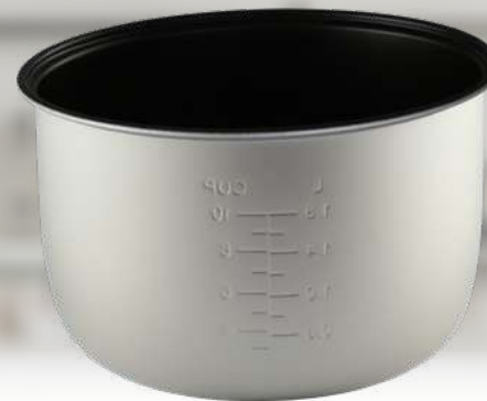
IP 3601 / 1005

Capacity: 3L | For MC 1003 Multicookers | 0,9mm thickness | Single sided Non-Stick coating |