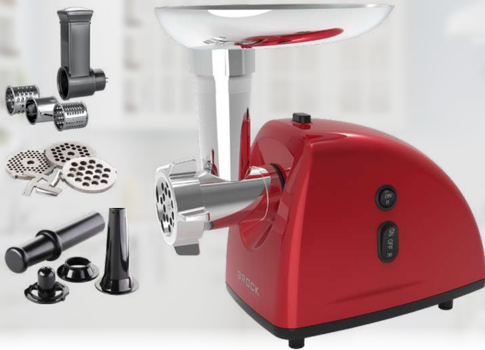
MG 1502 RD