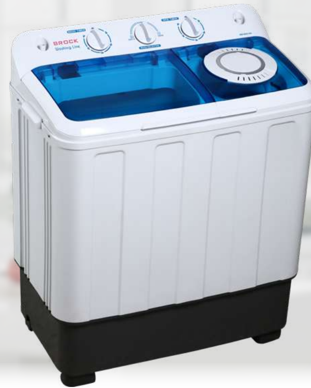
WM 6002 WH

Power: 300W | Max Capacity: 3kg | Mechanical control | 10 minutes wash timer | Spin function | Plastic body | Ecological & Safe and economical | Quiet operation | Ideal for long trips, camping or use at home due to it's small and compact size |