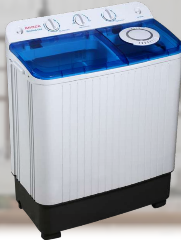
WM 7502 WH

Power: 300W (wash) | Max Capacity: 6.8 kg | Mechanical control 15 minutes wash timer | Plastic body | Quiet operation | Ecological & Safe and economical | IPX4 |