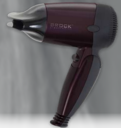
HD 8901 VT

Power: 1200-1600W | 2 power levels | 2 speeds | Cold air button | Ionisation function generates negative ions: Guarantees silkier and shinier hair without crinkling, Enables faster drying, Reduces static electricity, Prevents hair damage | Modern design | Folding handle | Hanging loop |