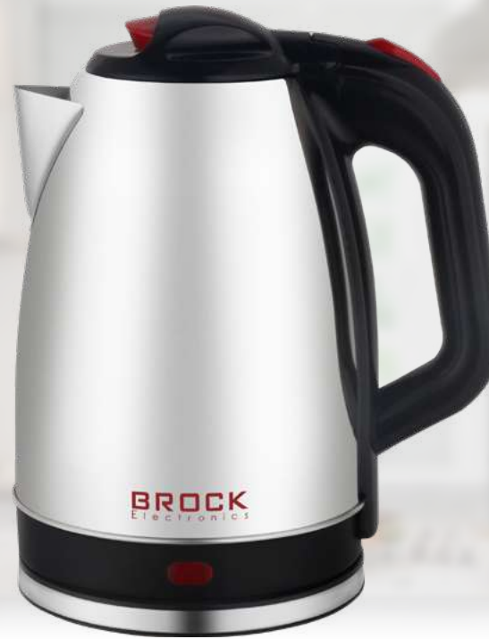
WK 0617 S