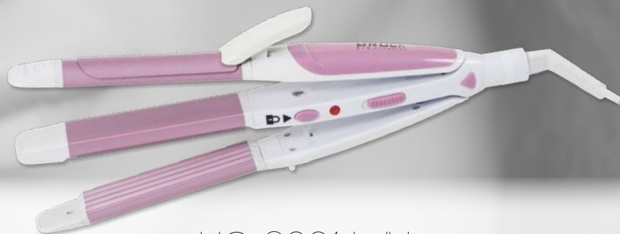
HC 3001 WH

Power: 50W | 3 in 1: Hair straightener, Crimper and Curler | Fast and easy selection of the desired work surface with one switch | Diameter of the iron: 32mm | PTC heating element heats up quickly and maintains a constant temperature | Max temperature: 200°C | On / Off switch | Red indicator light | Thermally insulated end for safe handling and turning of hair strands | Ergonomic design | 360° swivel power cord | Power cord length 1,8m |