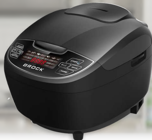
MC 5104 B

Volume: 5L | Power: 860W; 220-240V, 50/60Hz | Red LED display with 51 functions | 1.2m power cord, VDE plug | 1.32mm thickness double side Non-Stick coating inner pot | Heat maintenance and delayed start function up to 24 hours | White plastic + black panel sticker | 5 layers gift box with handle | Overheat protection | Accessories: Spoon, Ladle, Measure cup, PP steamer, Recipe book |