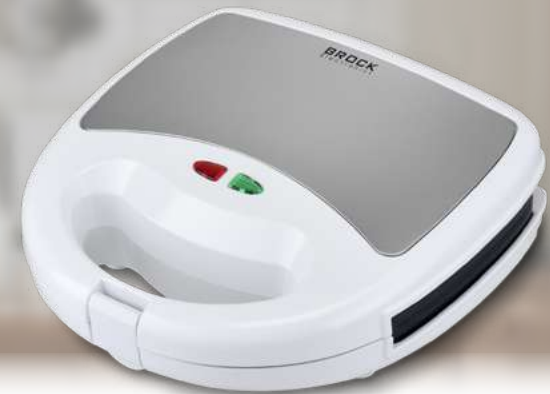
SSM 1001 WH

Power: 750W; 220-240V, 50/60Hz | Stainless steel design | Prepare 4 Triangle sandwiches | Automatic temperature control | Easy to clean baking surfaces | Non-Stick surface treatment of baking surfaces | Heat insulated handle and body | Power indicator - Red indicator light | Ready to bake indicator - Green indicator light | Option to store in a vertical position | Anti-Slip feet | Safety thermal fuse | Length of the power cord 75cm |