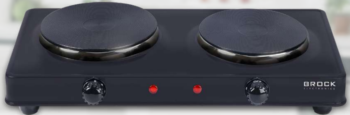
EP 200 BK

Power input 1000W; 220-240V, 50/60Hz | Hotplate with a diameter of 15.5cm | Ideal for college dorms, cottages or camping | Continuously controlled thermostat | Indicator light | Protection against overheating | Anti-Slip feet | Size: 22,4x 22,4cm |