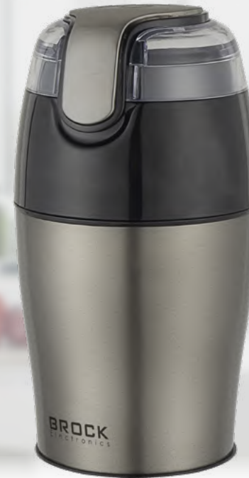
CG 4051 GY