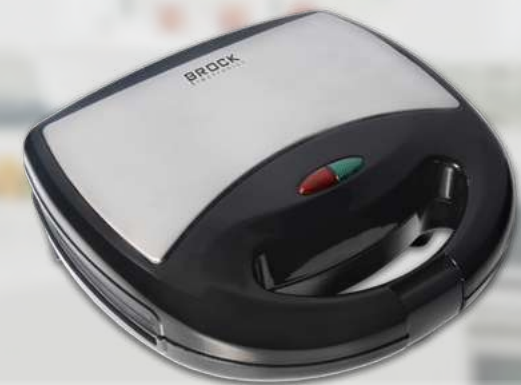
SSM 2004 SS

Power: 750W; 240V, 50/60Hz | Stainless steel design | Prepare 4 triangle sandwiches | Easy to clean baking surfaces | Option to store in a vertical position | Safety thermal fuse | Length of the power cord 75cm |