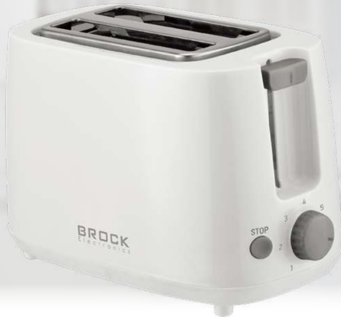
BT 1006 WH