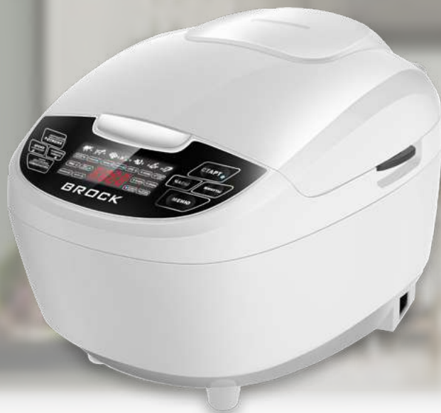
MC 5104 W