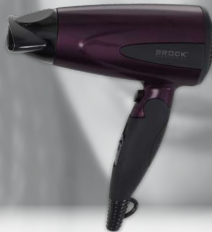
HD 8501 VT