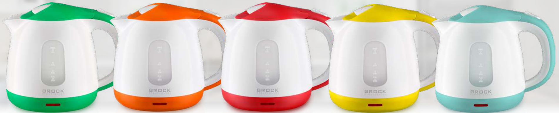
WK 0712 GR