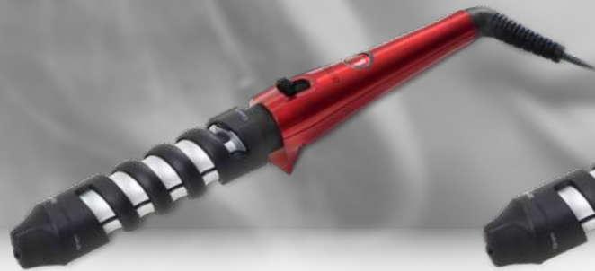
HC 6201 RD