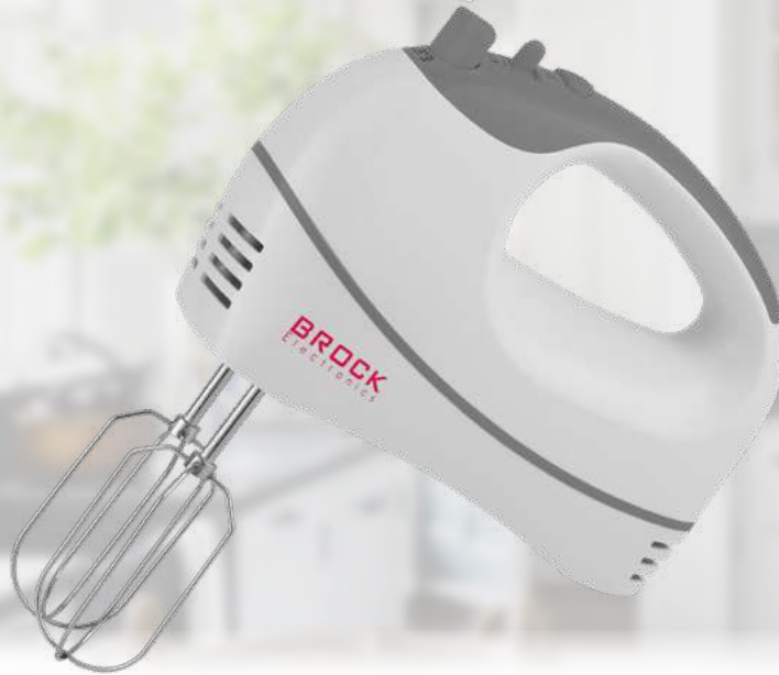
HM 4002 WH

Power: 300 W; 220-240V~ 50-60Hz | More through mixing and heavy duty mixing performance | 5 distinctive speed setting with Turbo | Stainless steel beaters & hooks |