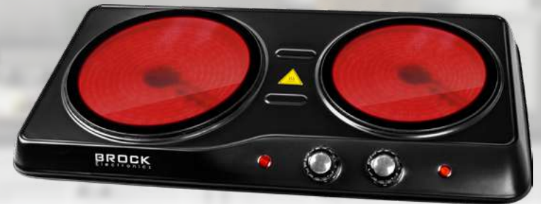
HPI 3002 BK

Power: 1200W | Single-zone | Glass plate diameter 17,7cm | On/Off indicator light | Adjustable temperature control | Auto-thermostat |