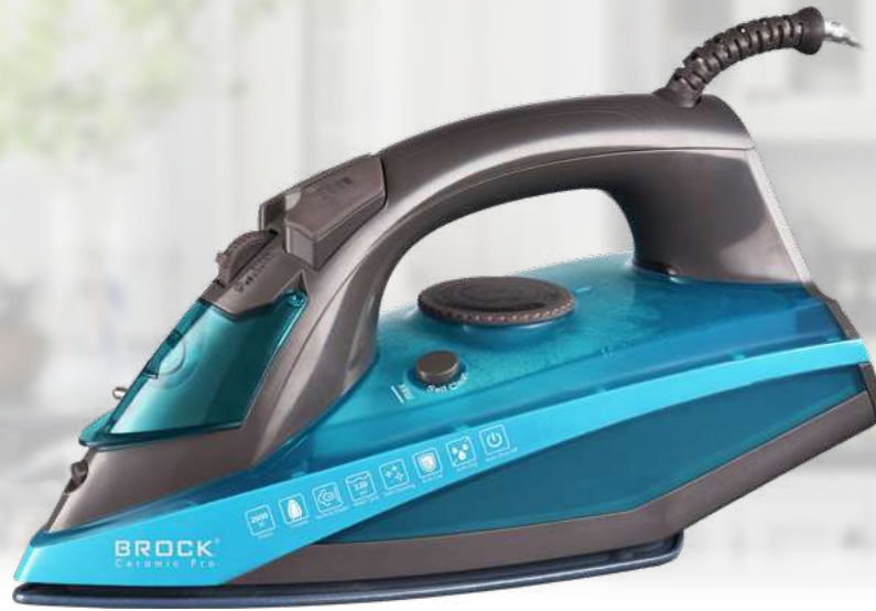
BSI 5502 BL