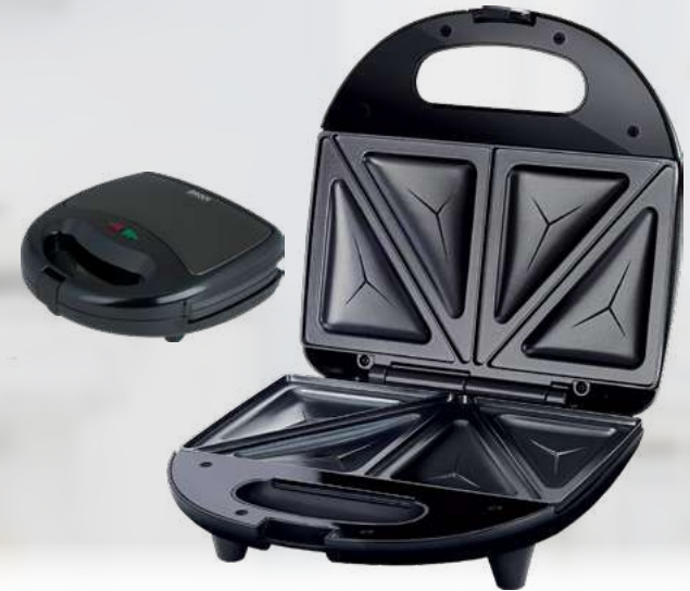
SSM 2001 GY

Power: 750W | Grill | Stainless steel sheet |