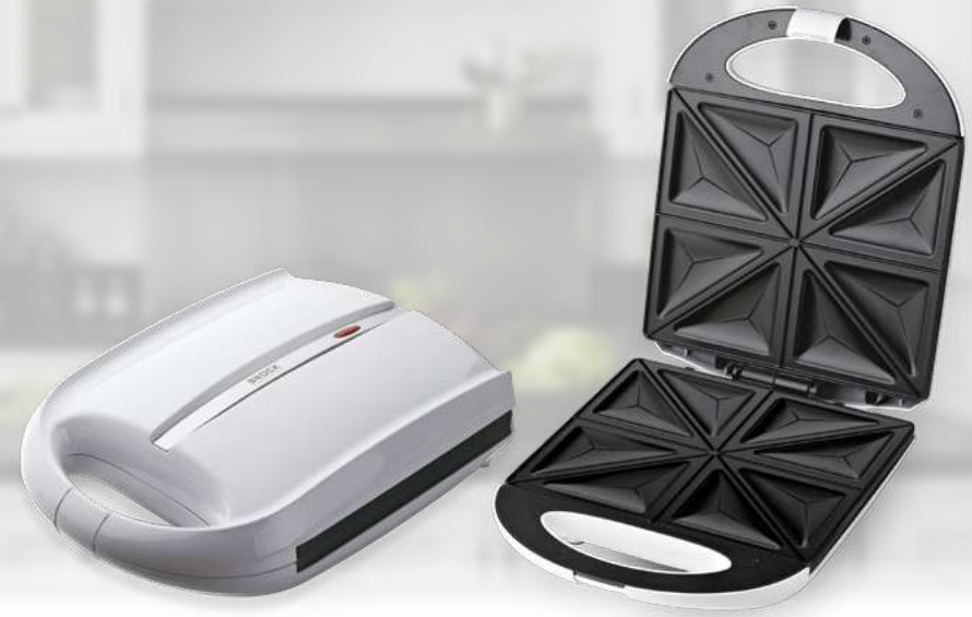
SSM 3008 WH

Power: 750W; 220-240V, 50/60Hz | Prepare 4 Triangle sandwiches | Removable plates from stainless steel | Power indicator - Red indicator light | Ready to bake indicator - Green indicator light |