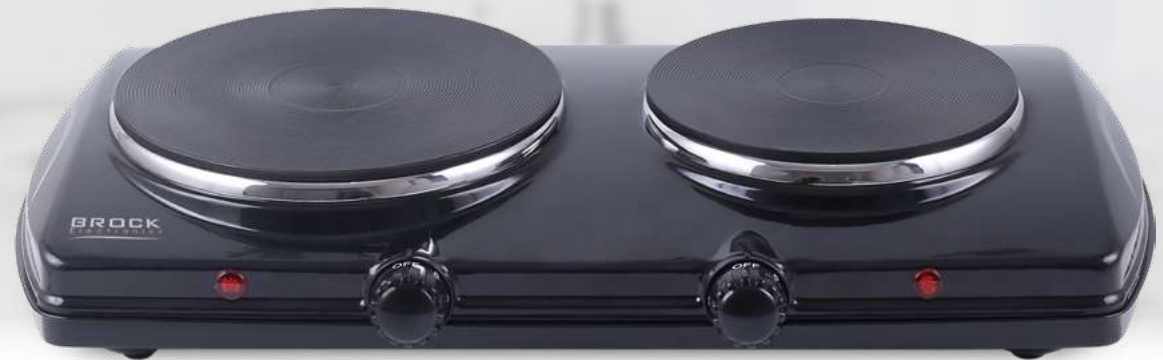
EP 2000 BK

Power: 1500 W; 220-240 V, 50/60 Hz | Hotplate with a diameter of 18.5 cm | Ideal for college dorms, cottages or camping | Indicator light | Protection against overheating | Anti-Slip feet |