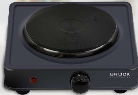
EP 100 BK

Power input 1000W; 220-240V, 50/60Hz | Hotplate with a diameter of 15.5cm | Ideal for college dorms, cottages or camping | Continuously controlled thermostat | Indicator light | Protection against overheating | Anti-Slip feet | Size: 22,4x 22,4cm |