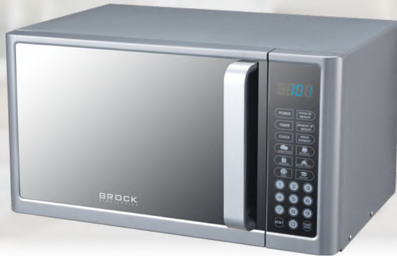
MWO 2311 DS