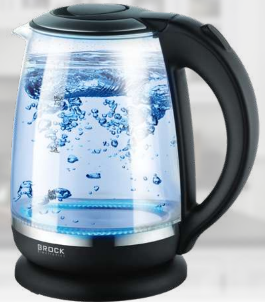
WK 2109 BK