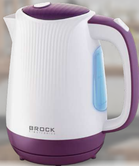
WK 08 PR