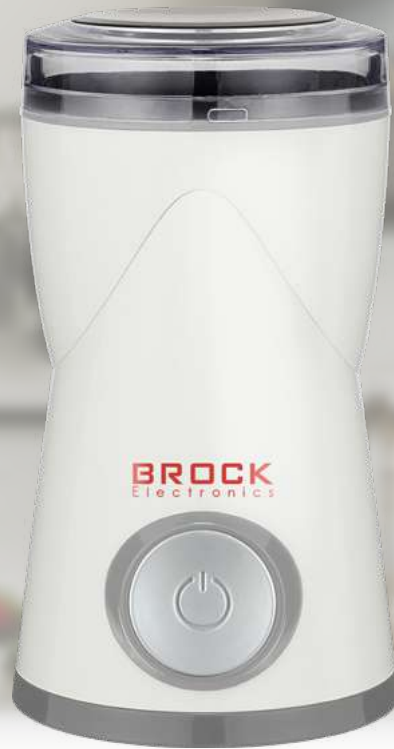
CG 3050 WH