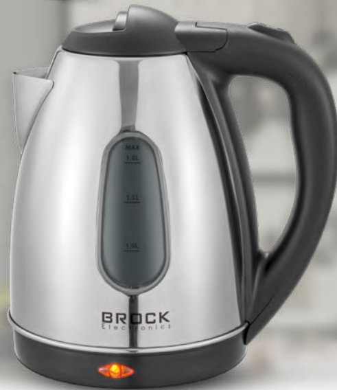
WK 0601 SS