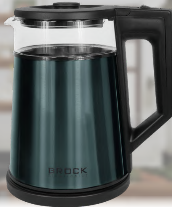
WK 9012 BL