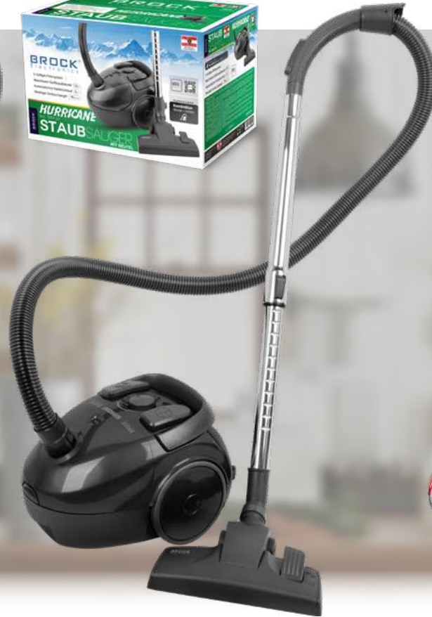
BVC 5002 GY