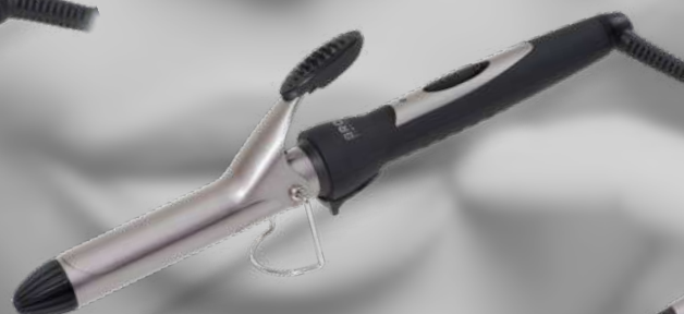
HC 6003 BK