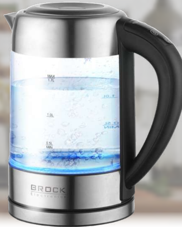
WK 2201 LL