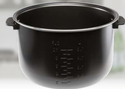
IP 5104 CC

Capacity: 5L | For MC 1005 Multicookers | 1mm thickness | Single sided Non-Stick coating |