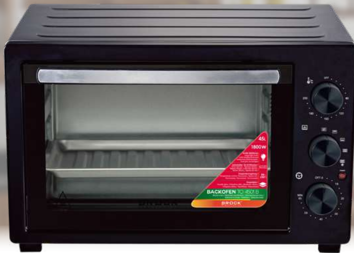
TO 4501 B

Volume: 45L | Power: 1500W; 220-240V, 50/60Hz | Stainless steel heating element | 60 min timer with alarm | Thermostat 100-230°C | Large interior lighting | Double glass |