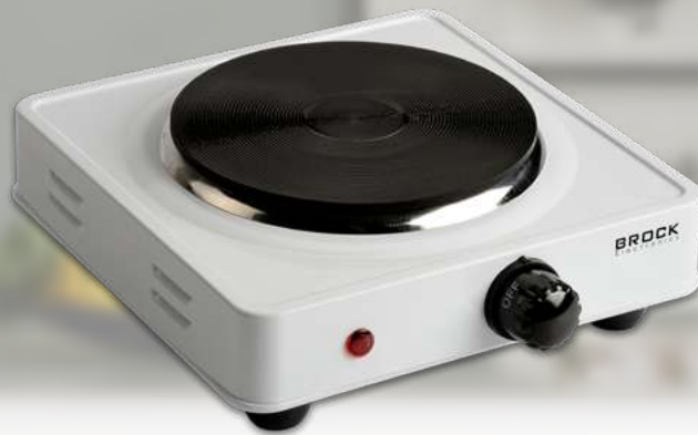
EP 100 WH

Power input 1000W; 220-240V, 50/60Hz | Hotplate with a diameter of 15.5cm | Ideal for college dorms, cottages or camping | Continuously controlled thermostat | Indicator light | Protection against overheating | Anti-Slip feet | Size: 22,4x 22,4cm |