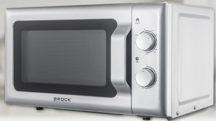
MWO 2001 SS

Volume: 20L | Power: 700W | Turntable: 245mm | 6 Power levels | Defrost function | "C.R.S" system (doble emission of waves) | 30 min timer | Reminder End Signal | Size: 262 x 452 x 345mm | Weight: 10.5kg |