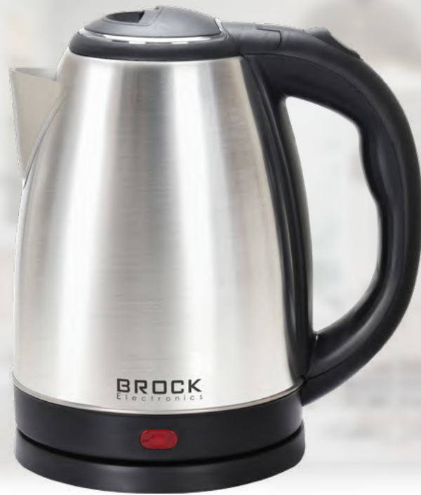
WK 0616 S