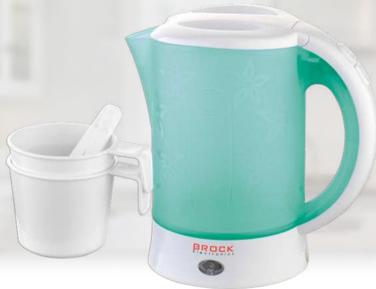
WK 0902 GR

Volume: 0,6L | Power: 550-650 W | On / Off switch | Triple safety system: Protection against overheating when turned on without water, Automatic Shut-Off when removed from the base, Automatic Shut-Off when boiling point is reached | Power cord storage in the base | Includes 2 drinking cups and 2 spoons |