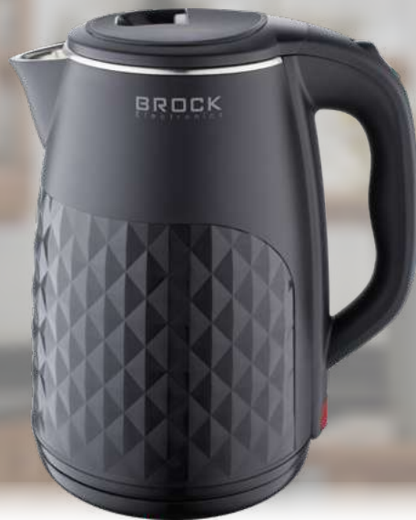
WK 0618 BK

Volume: 1,8L | Power: 1500W | Stainless steel body | Kettle with 360° base | Hidden heating element | Safety locking lid | Boil-dry protection | Automatic and manual switching On / Off | LED operating light |