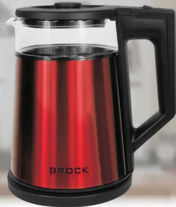
WK 9012 RD

Volume: 1,2L | Power: 1500W | High Tempered Glass Body | Stainless steel heating element | Auto Shut-Off | Overheat dual protection | With Blue LED light | Hinged lid | With inner stainless steel cover |