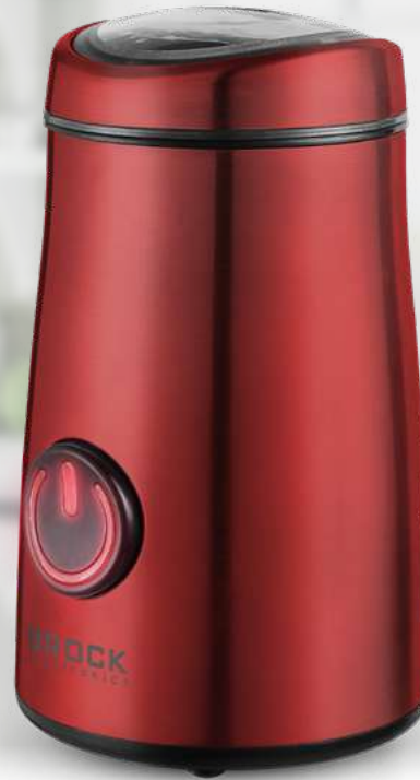
CG 2050 RD