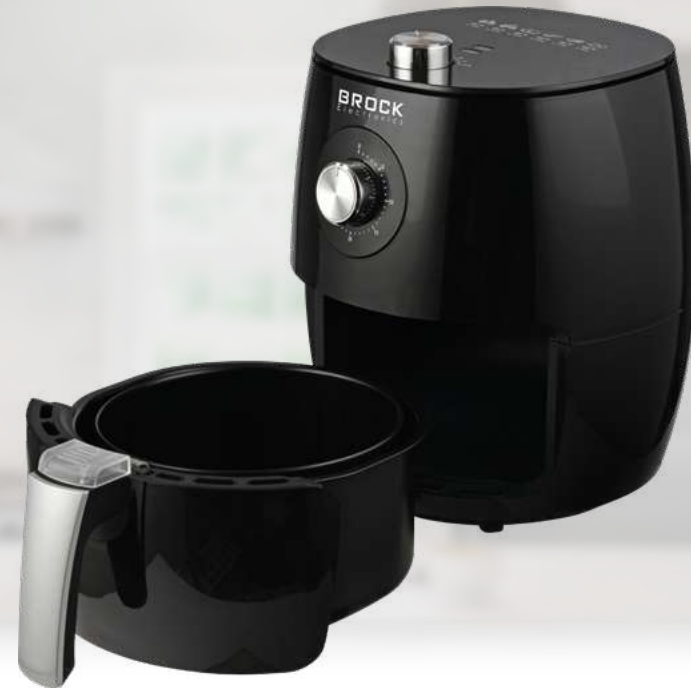
AFM 3501 BK

4.2 L | Power: 1500 W; 110-240V~50/60hz | Adjustable thermostat temperature setting | With over heating protection function | Auto shut Off | Non-stick frying basket & tray | Rapid air circulation system |