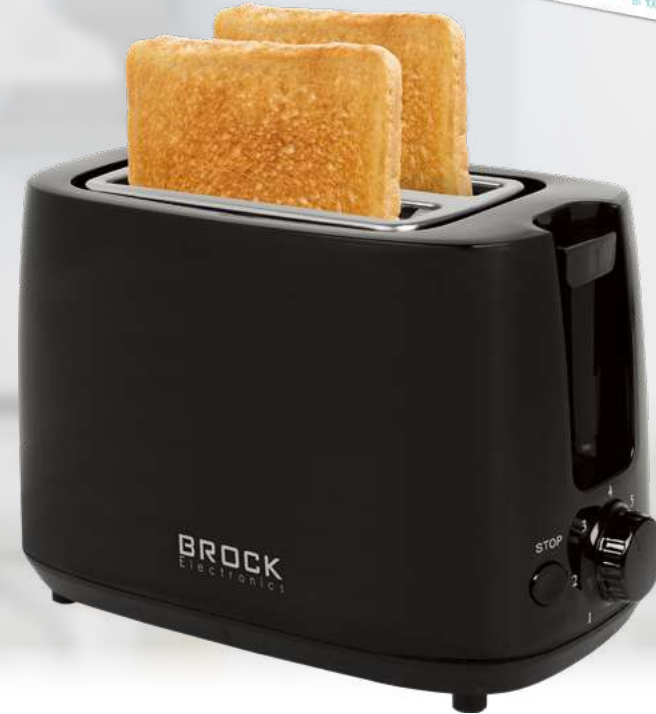
BT 1007 BK