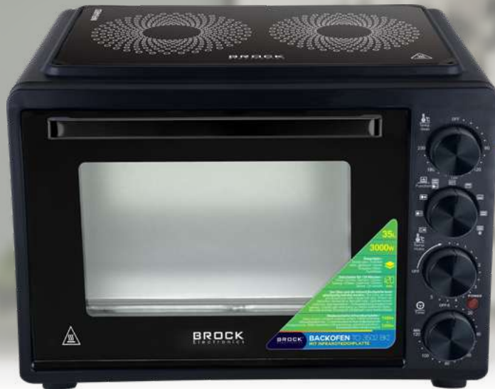
TO 3501 BK1

Volume : 35L | Oven Power: 1500W | Big hob Power: 1500W | Small hob Power:1200W | 90-230°C temperature selector | Oven can work at the same time with the big hob | 9 types of function selector | 120 minutes timer |