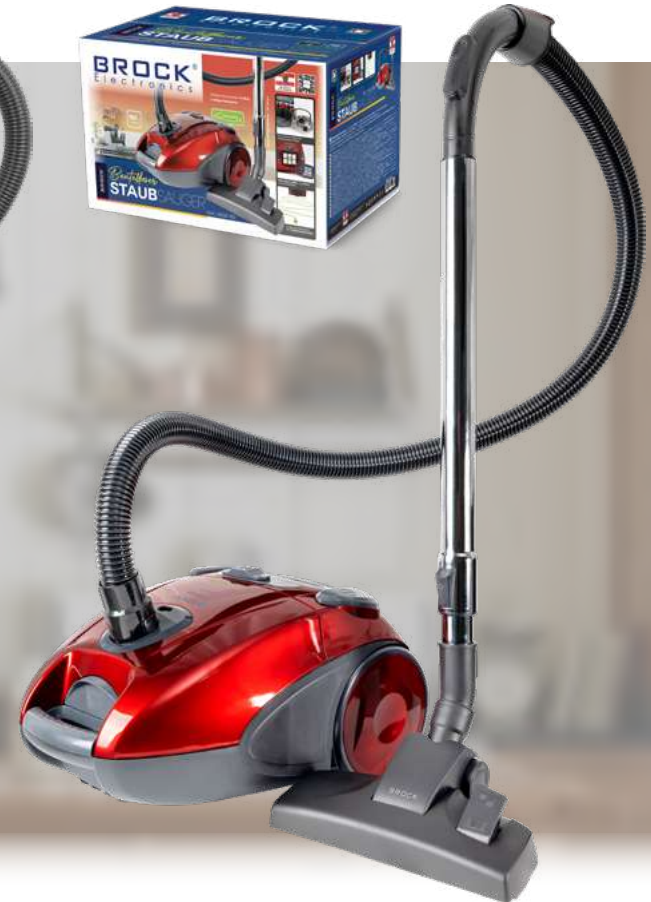
BVC 9000 RD

850W ECO Motor | 5 level filtration system | Chrome telescopic metal tube (440-700 mm) | Washable cloth dust bag | Volume of dust bag: 1.5L | Full dust bag indicator | Length of power cord: 5m (Action Radius 7.5m). 1.5M | Hose with air flow control on handle | Supplied accessories: Combination nozzle (Brush + Slot) | Auto cord rewind | Soft rubber on wheels | Low noise level: 79 dB(A) |