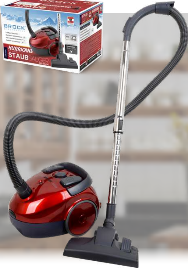
BVC 5002 RD