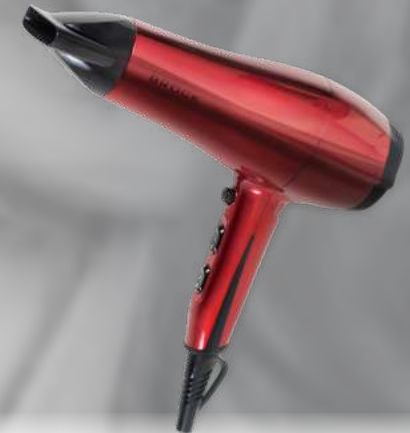
HD 8302 RD

Power: 1800W | 50% Quieter than leading hair dryers | 2 power levels | 2 speeds | With concentrator | Cool air function | Ionisation function | Vertically mounted fan design | Unique U-shaped air inlets | Hanging loop |