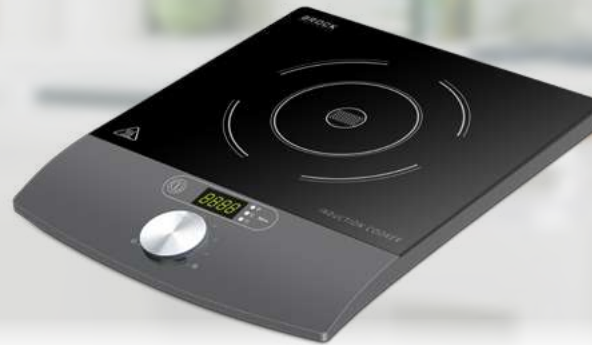
HP 2001 GY

Power: 1800W | Single-zone induction cooktop | Suitable for cookware with a diameter up to 26 cm |