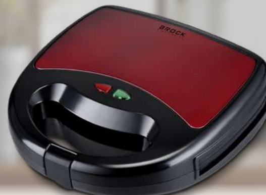
SSM 2001 RD