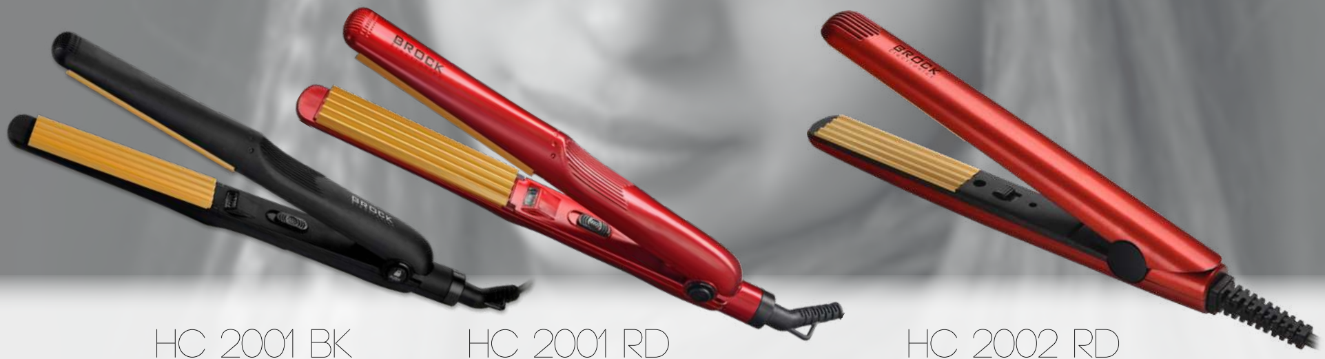
HC 2001 BK