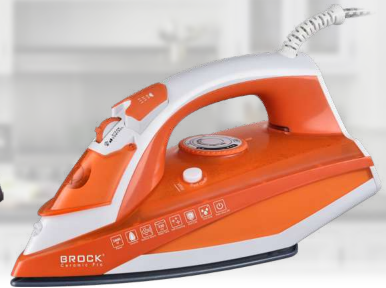
BSI 5503 OR

Power: 2600W; 220-240V 50Hz | Ceramic Ironing surface | Drip-Stop function for preventing water drop stains on fabrics | Anti-Calc function | Easy to fill transparent water tank (Volume 380 ml) | Continuous temperature control | Vertical steaming option | Steam boost | Continuous output steam regulation | Sprinkling button | Thermostat | 360° swivel power cord end limits twisting and tangling |