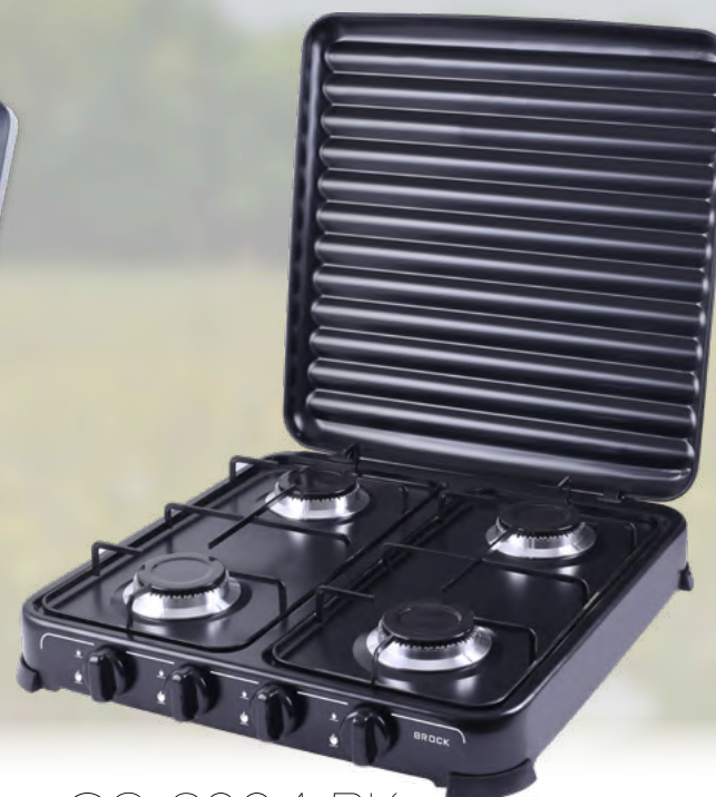
GS 2004 BK

Designed for outdoor use only | Comfortable stove for picnics in nature | Works with G30 butane (28-30 mbar) and G31 propane (37mbar) gas | LPG gas consumption | Qualitative cast iron burners | Durable iron body | Location: table or similar, stable, horizontal surface |