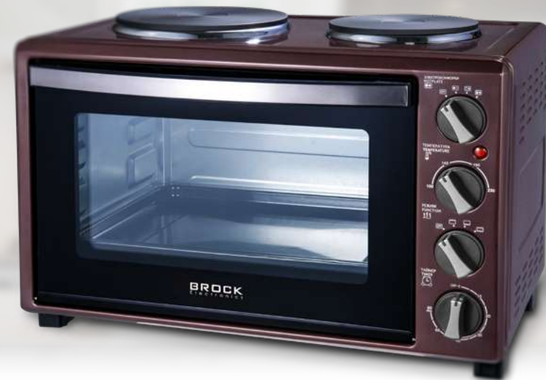
TO 3002 P

Volume: 30L | Power: 1500W; 220-240V, 50/60Hz | Hotplates:1000W+600W | Stainless steel heating element | 60 min timer with alarm | Thermostat 100-230°C | Heating functions: Off / Heating from top / Heating from bottom / Heating from top and bottom | The large interior lighting | Double glass | Convection function | Stainless steel handle | Accessories: Baking tray, Wire rack, Tray handle |