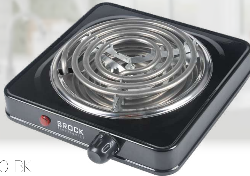
EP 1500 BK