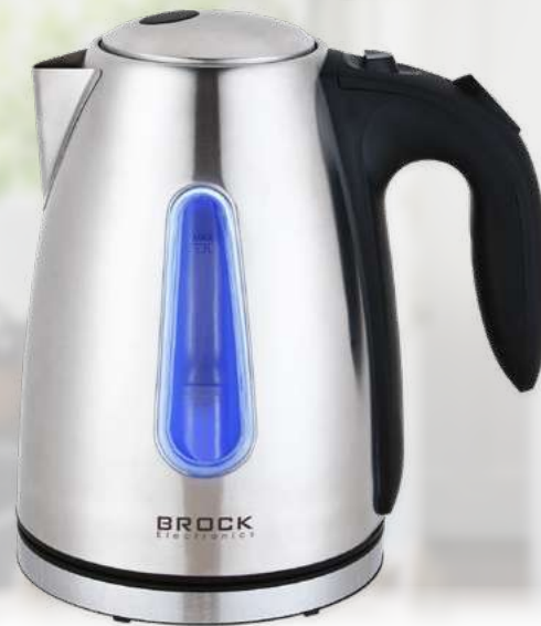
WK 02 SS