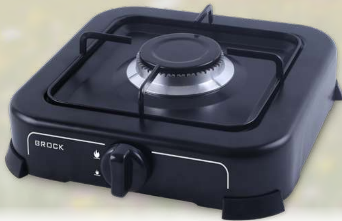
GS 2001 BK