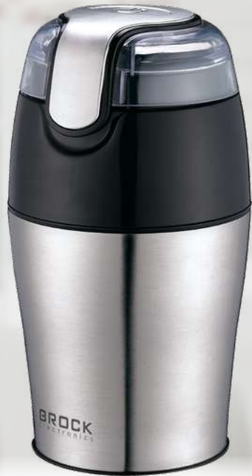
CG 4050 SS