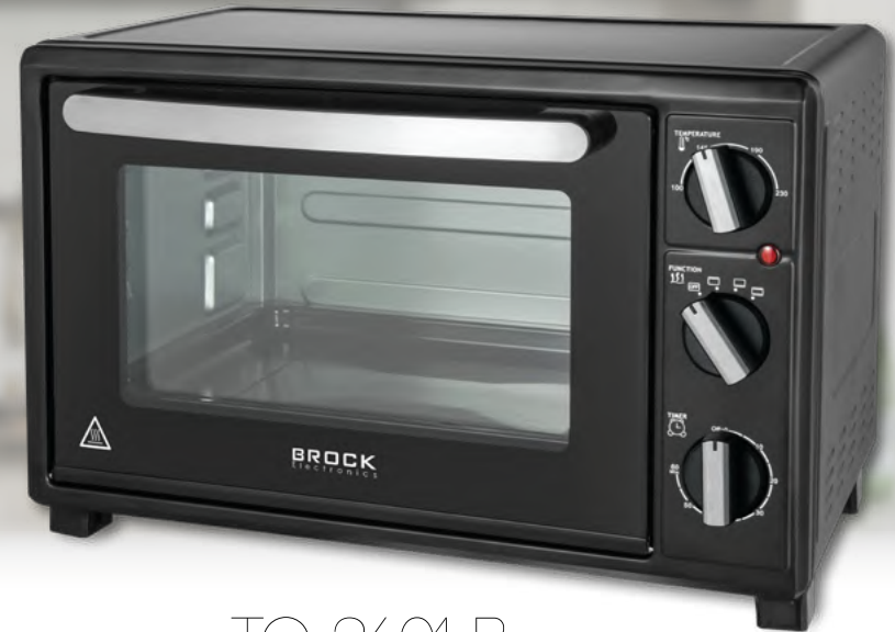
TO 2601 B

Volume: 26L | Power: 1500W; 220-240V, 50/60Hz | Large interior lighting | Double glass | Convection function |