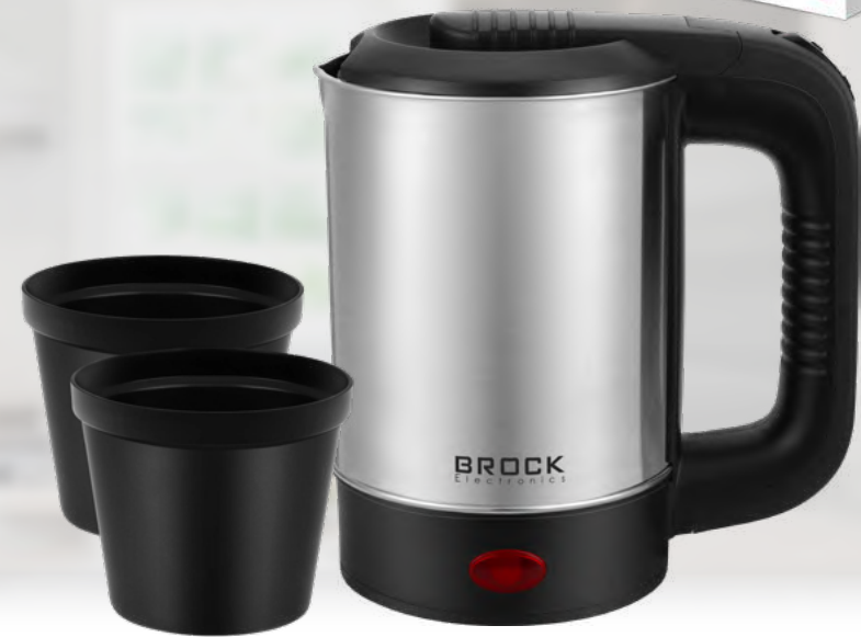
WK 0903 S

Volume: 0,6L | Power: 550-650 W | On / Off switch | Triple safety system: Protection against overheating when turned on without water, Automatic Shut-Off when removed from the base, Automatic Shut-Off when boiling point is reached | Power cord storage in the base | Includes 2 drinking cups and 2 spoons |