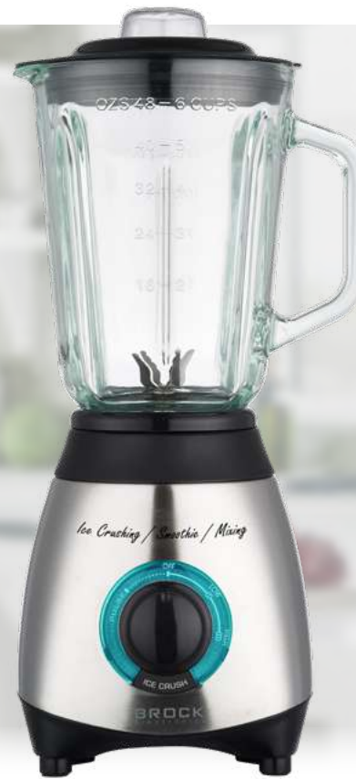
BL 1502 SS