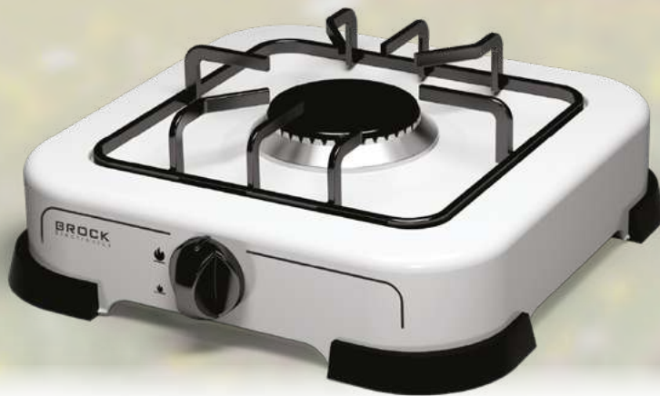
GS 001 W