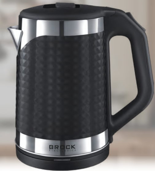
WK 0818 BK

Volume: 1,8 L | Power: 1500W | Double wall Body | Concealed heating element | Auto Shut-Off | Light indicator | Outside with plastic wall, inside with stainless steel body | Hinged lid |