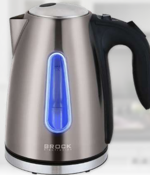
WK 02 GY