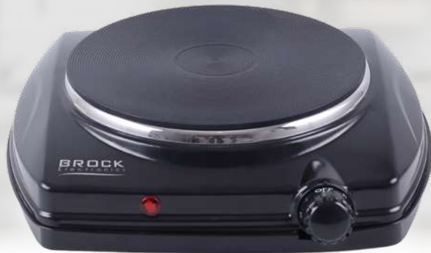
EP 1500 BK

Power: 1500 W; 220-240 V, 50/60 Hz | Hotplate with a diameter of 18.5 cm | Ideal for college dorms, cottages or camping | Indicator light | Protection against overheating | Anti-Slip feet |