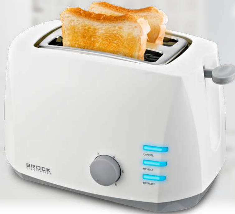
BT 1002 WH