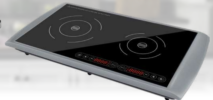
HP 3002 SS

Power: 1800W | Single-zone induction cooktop | Suitable for cookware with a diameter up to 17 cm |