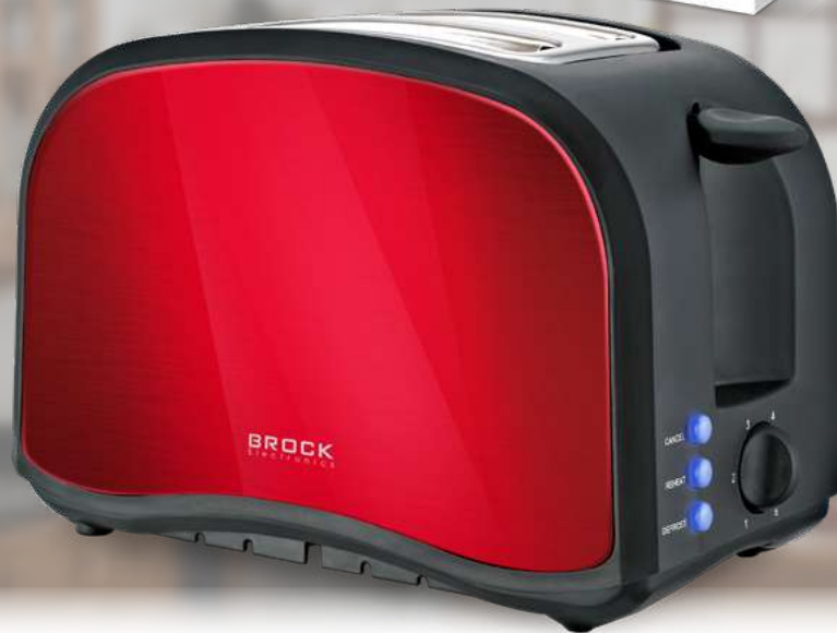
BT 1002 RD