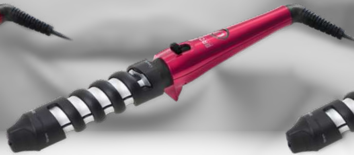
HC 6201 PK