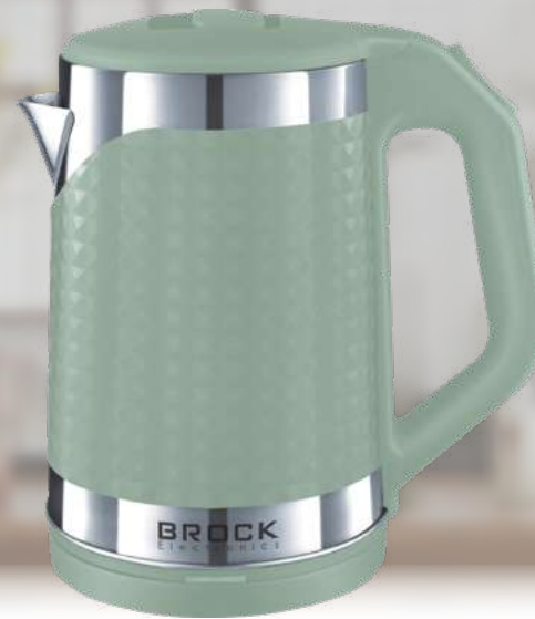
WK 0818 GR

Volume: 1,8L | Power: 1500W | Stainless steel body | Kettle with 360° base | Hidden heating element | Safety locking lid | Boil-dry protection | Automatic and manual switching On / Off | LED operating light |