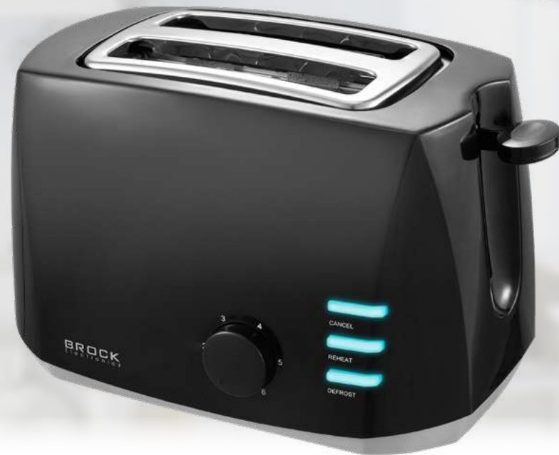
BT 1005 BK

Power: 800W | 2 slots | 6 adjustable browning settings | On/Off switch | Defrost, Cancel, Reheat and Auto centering function | Auto Pop-Up function | Removable crumb tray | Size (length x width x height): 29.1x18.1x19 cm |