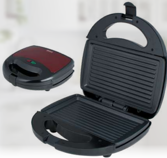
SGM 2002 RD