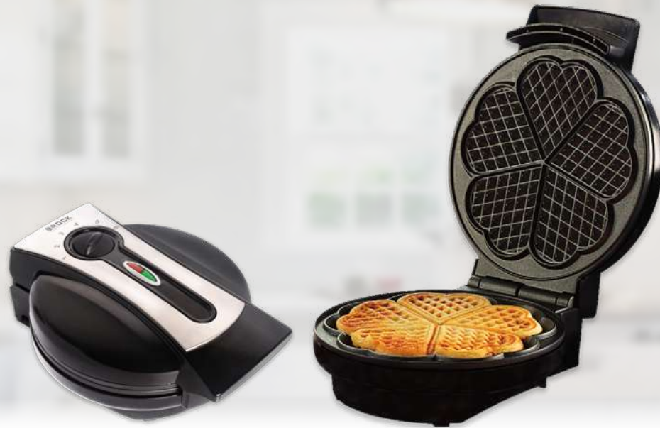
WM 3002 BK