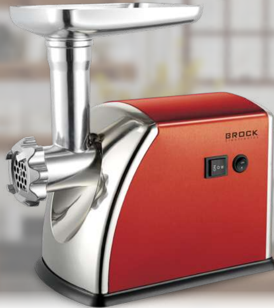
MG 1601 RD