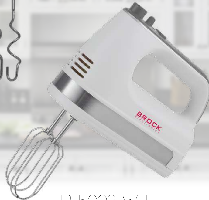
HB 5003 WH

Power: 300 W; 220-240V~ 50-60Hz | More through mixing and heavy duty mixing performance | 5 distinctive speed setting with Turbo | Stainless steel beaters & hooks |