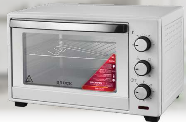
TO 3001 WH

Volume: 30L | Power: 1500W; 220V-240V, 50/60Hz | Stainless steel heating element | 60 min timer with alarm | Thermostat 100-230°C | Heating functions: Off / Heating from top / Heating from bottom / heating from top and bottom | The large interior lighting | Double glass | Convection function | Stainless steel handle | Accessories: Baking tray, Wire rack, Tray handle |