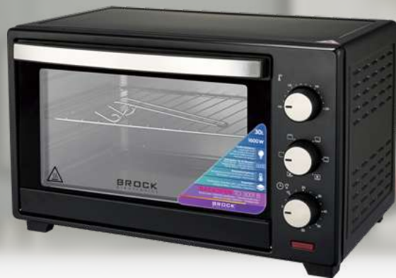
TO 3001 B