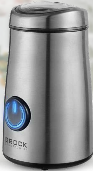
CG 1050 SS