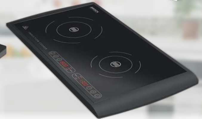
HP 2002 GY

Power: 1800W | Single-zone induction cooktop | Suitable for cookware with a diameter up to 17 cm |