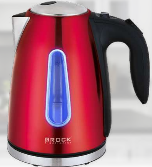
WK 02 RD

Volume: 1,7L | Power: 1800W; 220-240V, 50/60Hz | Stainless steel body | Unique cover design, easy operation | Removable and washable filter for removing deposits and impurities | Illuminated water level indicator | Triple safety system: Protection against overheating when turned on without water, Automatic Shut-Off when removed from the base, Automatic Shut-Off when boiling point is reached | Central 360° connector | Power cord storage in the base |