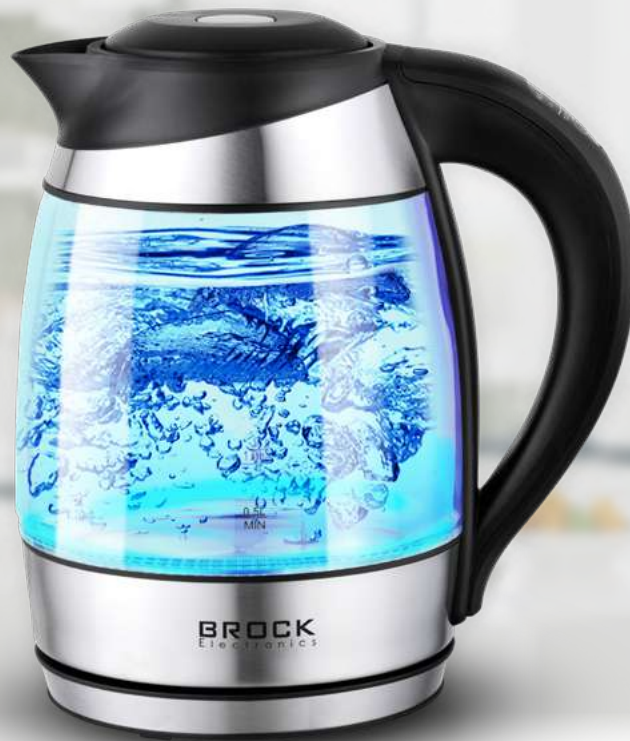
WK 2106 LL