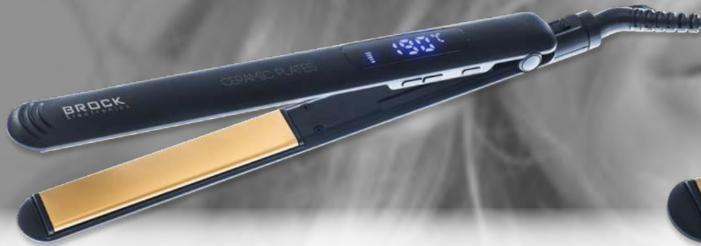
HC 5001 BK

Power: 60W | Ironing surface area: 25 x 110mm | Adjustable temperature: 150-230°C | LED current temperature display | Temperature lock |