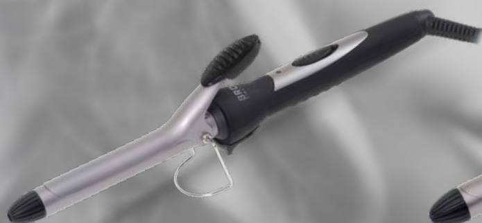
HC 6002 BK