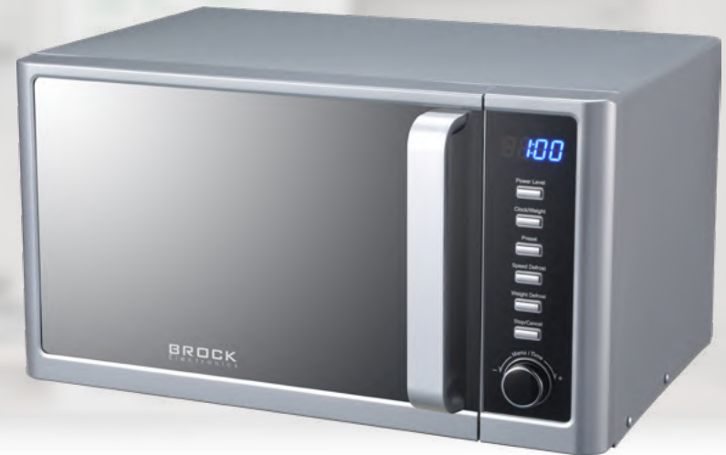
MWO 2322 DS

Volume: 23L | Power: 700W | Turntable: 245mm | 6 Power levels | Defrost function | "C.R.S" system (doble emission of waves) | 30 min timer | Reminder End Signal | Size: 262 x 452 x 345mm | Weight: 10.5kg |