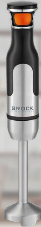
HB 8001 WH

Power: 1000 W; 220-240V~ 50-60Hz | DC motor | Stepless speed control | Detachable rod | Stainless steel blade |