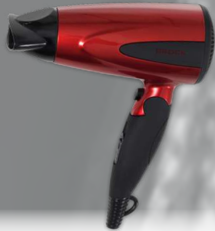
HD 8501 RD