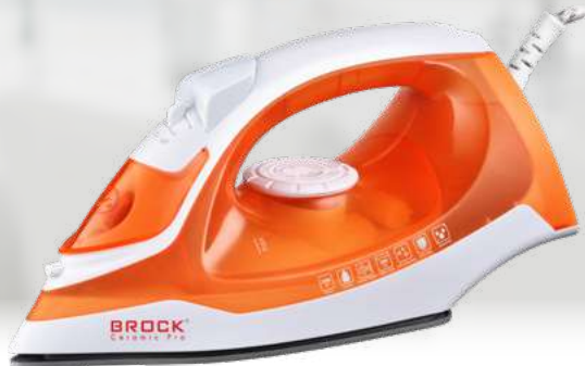
BSI 2012 OR