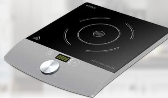
HP 3001 SS

Power: 1800W | Single-zone induction cooktop | Suitable for cookware with a diameter up to 26 cm |