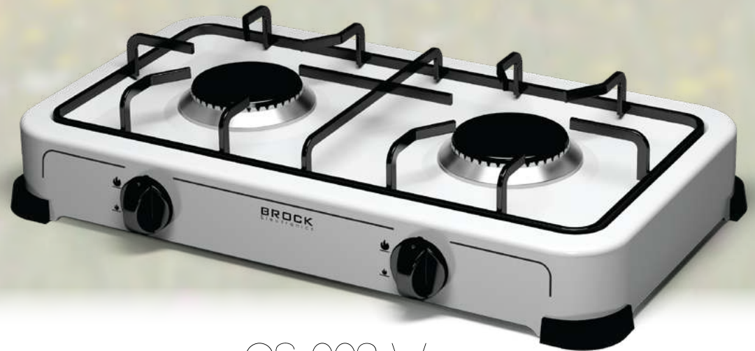
GS 002 W

Designed for outdoor use only | Comfortable stove for picnics in nature | Works with G30 butane (28-30 mbar) and G31 propane (37mbar) gas | LPG gas consumption | Qualitative cast iron burners | Durable iron body | Location: table or similar, stable, horizontal surface |