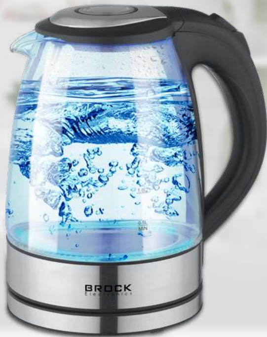
WK 2102 BK