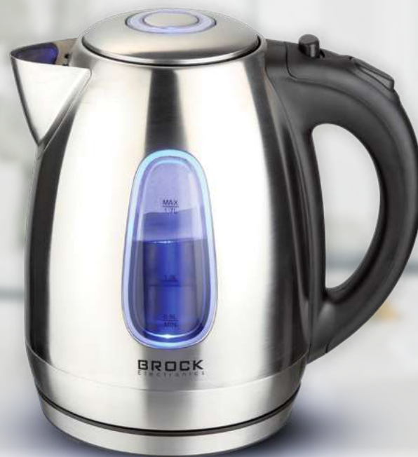
WK 06 SS