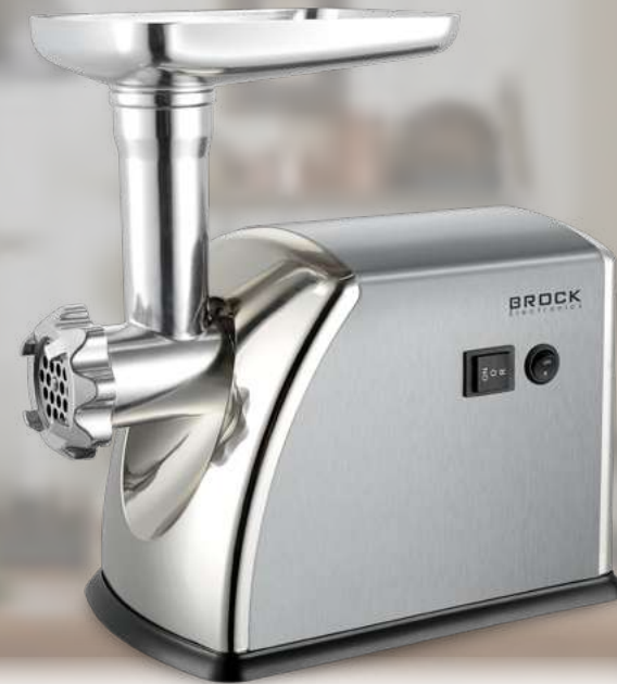
MG 1601 SS

Maximum Power: 1600W | Stainless steel housing | Stainless steel blade | Reverse function | Low noise: 50/60 Hz | Capacity: 1 kg/min | Cutter + vegetable cutter attachment with 3 cutters | Exchangeable 3 metal cutting plates: 3mm, 5mm, 7mm | Detachable aluminum die-cast parts for easy cleaning | Voltage: 220 ~ 240V | Accesories: Sausage accessory, Kibbe accessory, Food pusher |