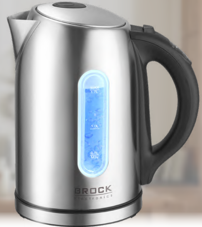
WK 2302 D

Glass Kettle | Volume: 1,7L | Double-sided water level mark | Volume: 1,7L | One-sided water level mark |