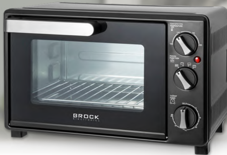
TO 1801 B

Volume: 18L | Power: 1200W; 220-240V, 50/60Hz | Internal lighting |