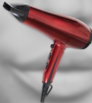
HD 8201 RD