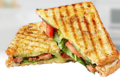
SSM 4001 XL

Power: 750W | Plate size - 28x14.5cm | Fixed cooking plate with Non-Stick coating | Thermostatically controlled | Power indicator - Red indicator light | Ready to bake indicator - Green indicator light | Cool touch housing | Skid-resistant feet |