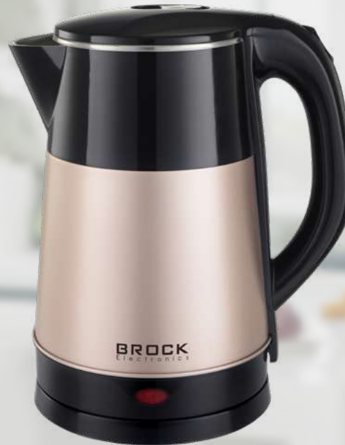
WK 8122 GD