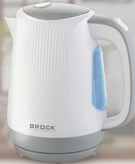
WK 08 GY