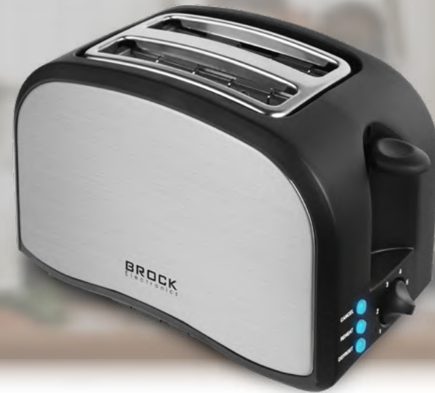
BT 1003 SS

Power: 800W | Stainless steel housing | 2 slots | 6 adjustable browning settings | On / Off switch | Defrost, Cancel, Reheat and Auto centering function | Auto Pop-Up function | Removable crumb tray | Size (length x width x height): 28.1x15.6x18.8 |