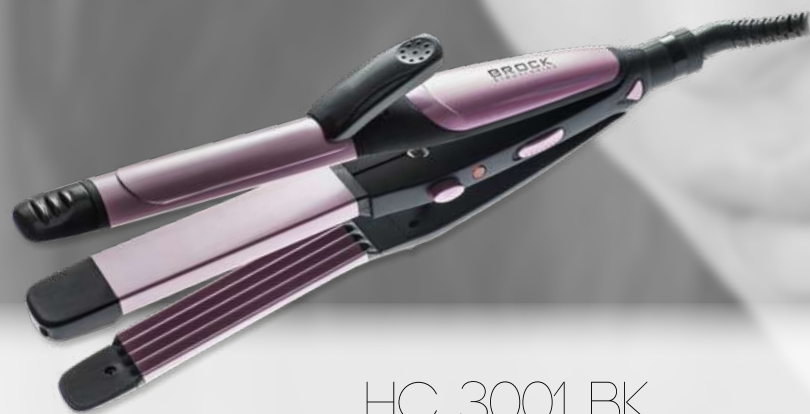
HC 3001 BK