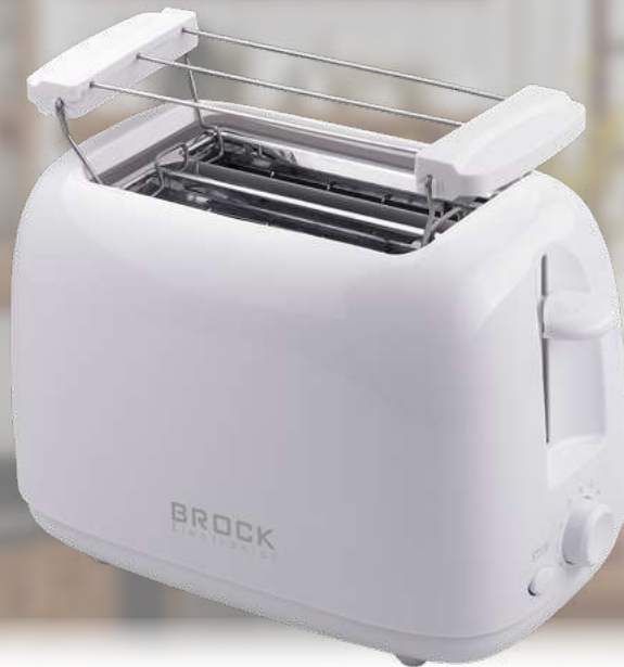
BT 1008 WH