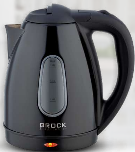
WK 0604 BK