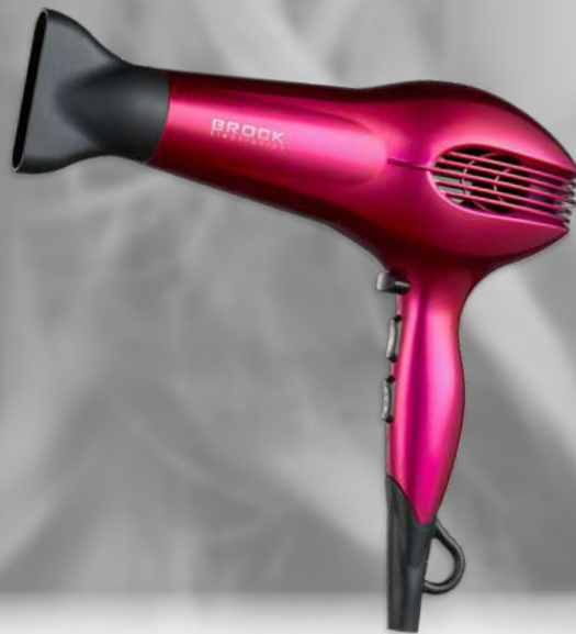
HD 9501 PK