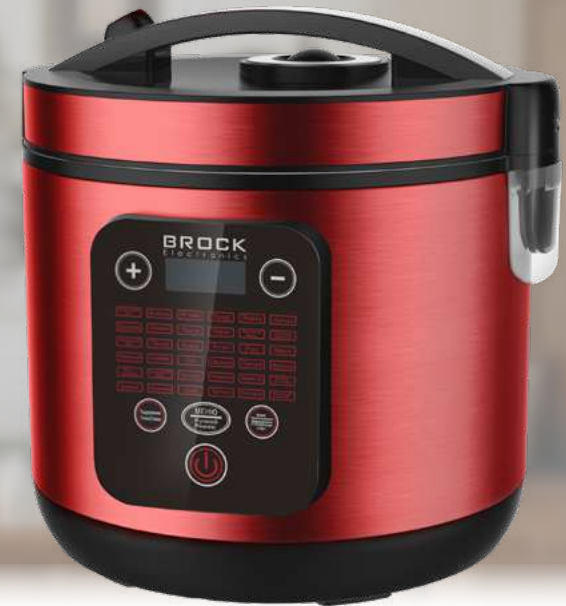
MC 3602 RD

Volume: 5L | Power: 700W | With 36 cooking functions | Stainless steel housing | Inner pot with ceramic housing | Large LED display | Touch sensor control | Flexible timer | Automatic warm up functions and possibility to put 24 hours food's warming | Delayed start function up to 24 hours | Overheat protection | Removable steam valve | Accessories: Spoon, Ladle, Measure cup, PP steamer, Recipe book |