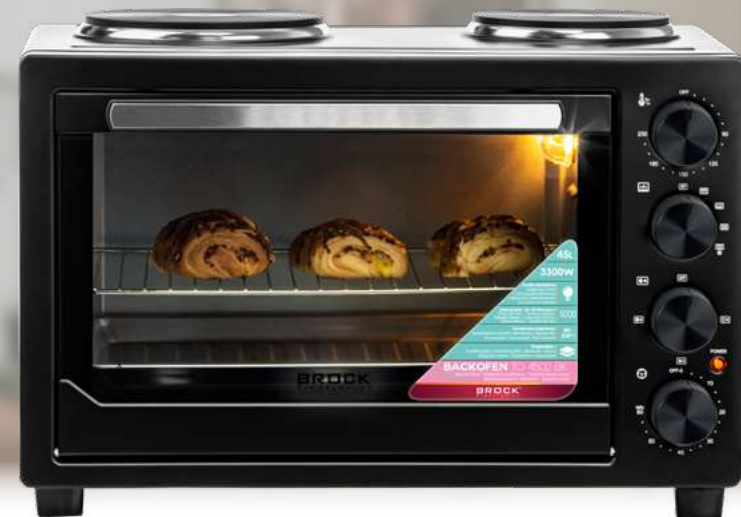
TO 4502 BK

Heating functions: Off / Heating from top / Heating from bottom / heating from top and bottom | Convection function | Stainless steel handle | Accessories: Baking tray, Wire rack, Tray handle |