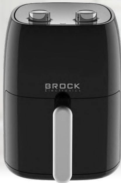
AFM 4203 BK

4.2 L | Power: 1500 W; 110-240V~50/60hz | Adjustable thermostat temperature setting | With over heating protection function | Auto shut Off | Non-stick frying basket & tray | Rapid air circulation system |