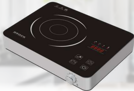
HP 3021 SS

Power: 1800W | Single-zone induction cooktop | Suitable for cookware with a diameter up to 26 cm |