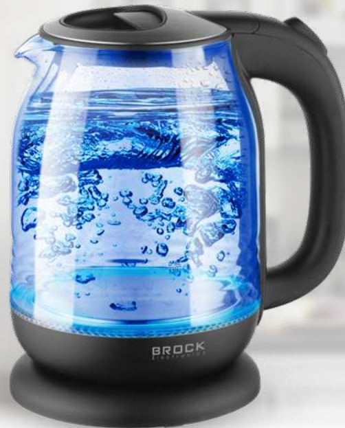
WK 2107 BK