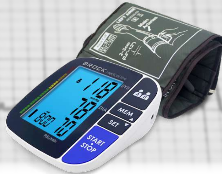
TMB - 1873

Blood pressure monitor | Wrist type, digital BPM for easy measurement in domestic conditions | Large and bright LCD display for easy and convenient reading of results | Designed for adults' blood pressure and heart rate measurement |