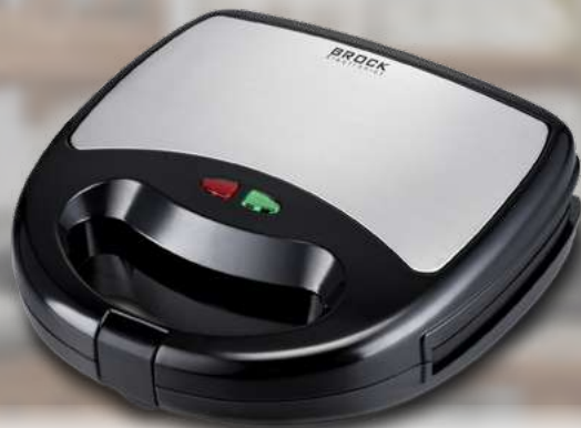
SSM 2001 SS