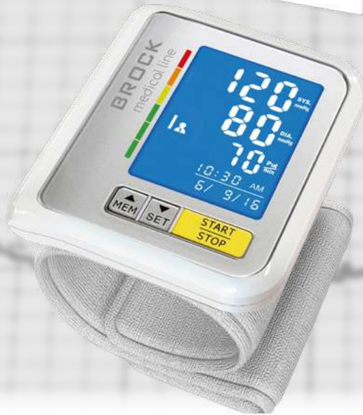
LS 810 - S