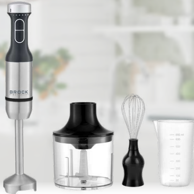
HBS 9002 WH

Power: 1000W 220-240V~ 50-60Hz | DC motor | 2 speed control with variable speed | Detachable rod | Stainless steel blade | Accessories: 500ml chopper bowl | 650ml Cup | Egg whisk |