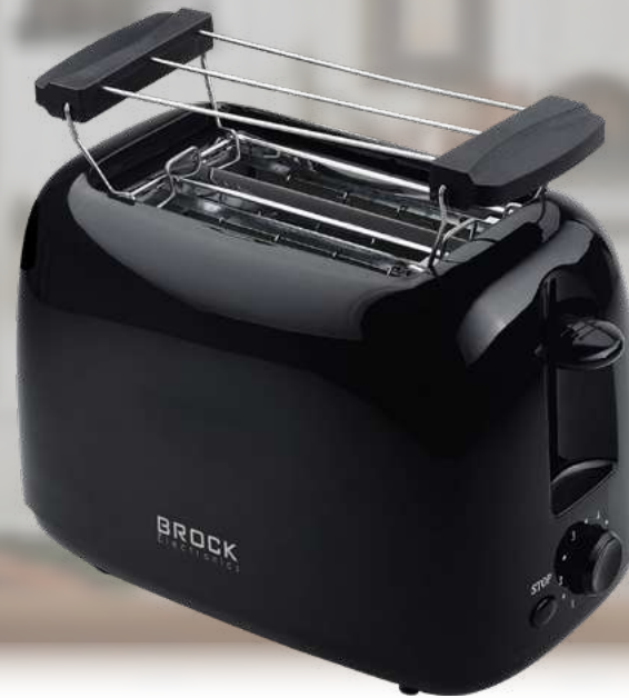
BT 1009 BK

Power: 650-700 W; 220-240V; 50/60Hz | 2-slice, Pop-up | Variable electronic timing control | Anti-jammed protection | Auto shut Off | Mid cycle cancel function | Slide out crumb tray |