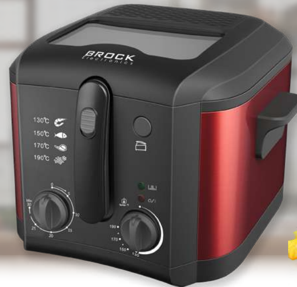
DF 2501 RD

Power: 2200W | Volume: 3,2L | Stainless steel housing | Optional timer function for 30min | Detachable SS inner pot | Double sensor for extra safety | Indicator light | Lid with transparent window and smoke filter | Thermostat control 130°C - 190°C | Power cord length: 90cm |