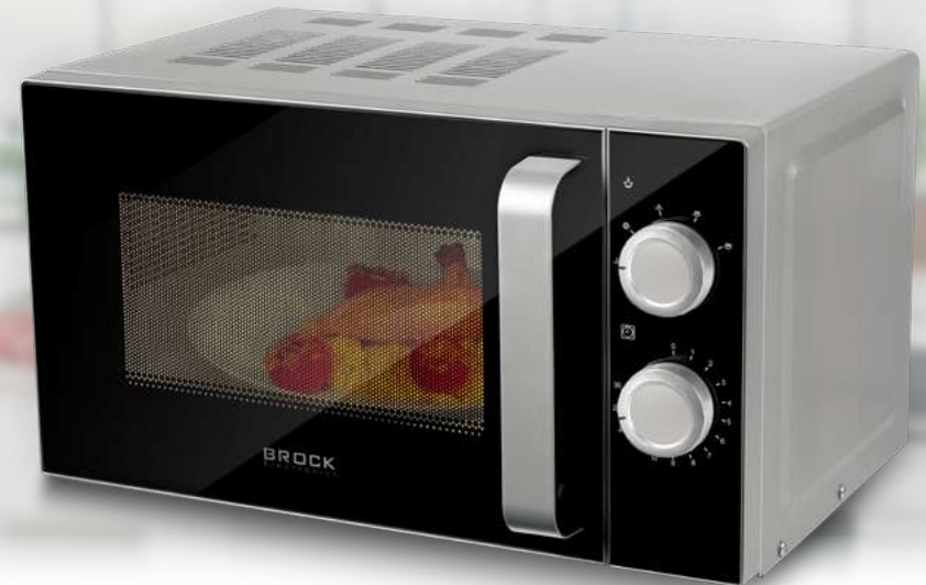
MWO 2012 SS

Volume: 20L | Power: 700W | Turntable: 245mm | 6 Power levels | Defrost function | 30 min timer | Reminder End Signal | Size: 262 x 452 x 345mm | Weight: 10.5kg |