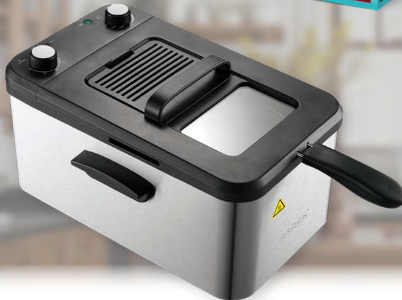
DF 3001 SS

Power: 2200W | Volume: 3,2L | Stainless steel housing | Optional timer function for 30min | Detachable SS inner pot | Double sensor for extra safety | Indicator light | Lid with transparent window and smoke filter | Thermostat control 130°C - 190°C | Power cord length: 90cm |