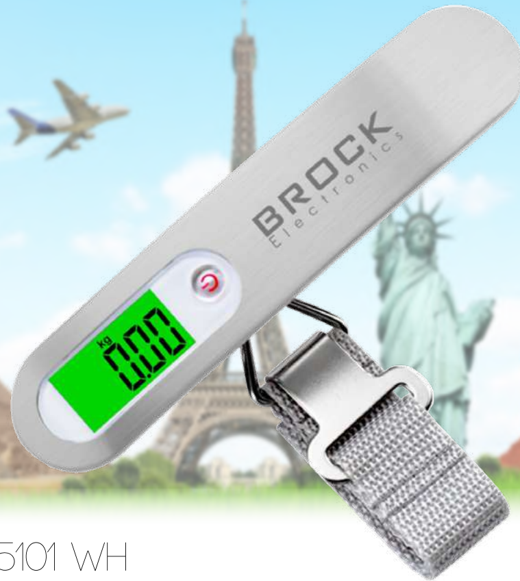
TLS 5101 WH

Range/Accuracy: 50kg/10g | Units: kg, lbs, oz, g | Stainless Data lock | Low battery indication | Automatic power Off | Overload indication | Power supply: 1 x CR2032 battery | Product size: 15.2 x 3 x 4 cm |