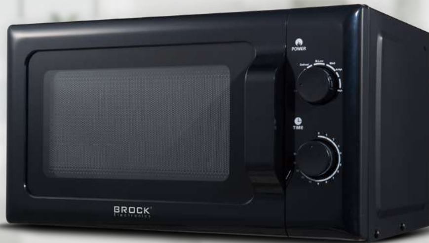
MWO 2001 BK