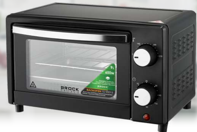
TO 9001 B

Volume: 60L | Power: 1500W; 220-240V, 50/60Hz | Stainless steel heating element | 60 min timer with alarm | Thermostat 100-230°C. Heating functions: Off / Heating from top / Heating from bottom / Heating from top and bottom | The large interior lighting | Double glass | Convection function | Stainless steel handle | Accessories: Baking tray, Wire rack, Tray handle |