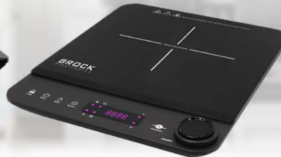
HP 4003 GY

Power: 2000W + 2000W | Suitable cooking area: pot base diameter 12-20cm | 2 cooking surfaces: ceramic, 2x 26x26cm | 8 levels of cooking power - 200 - 2000W | Display shows cooking temperature, power, timer | 5 special designed cooking function: Fry / Boil / Water / Stew / Heat-Up | Button controlled panel |