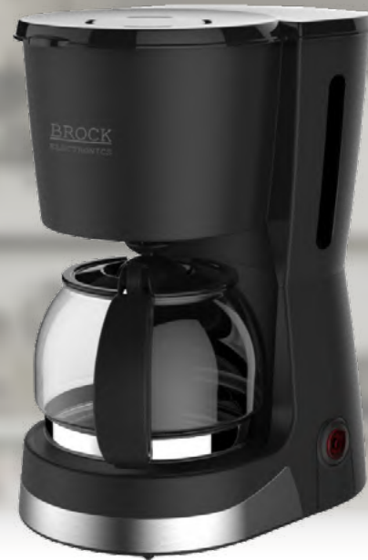
CM 1501 SS