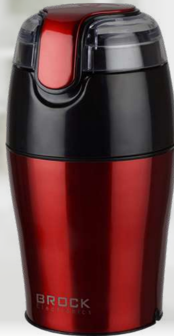
CG 4050 RD