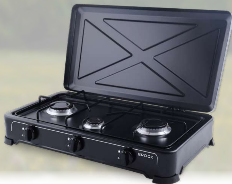
GS 2003 BK