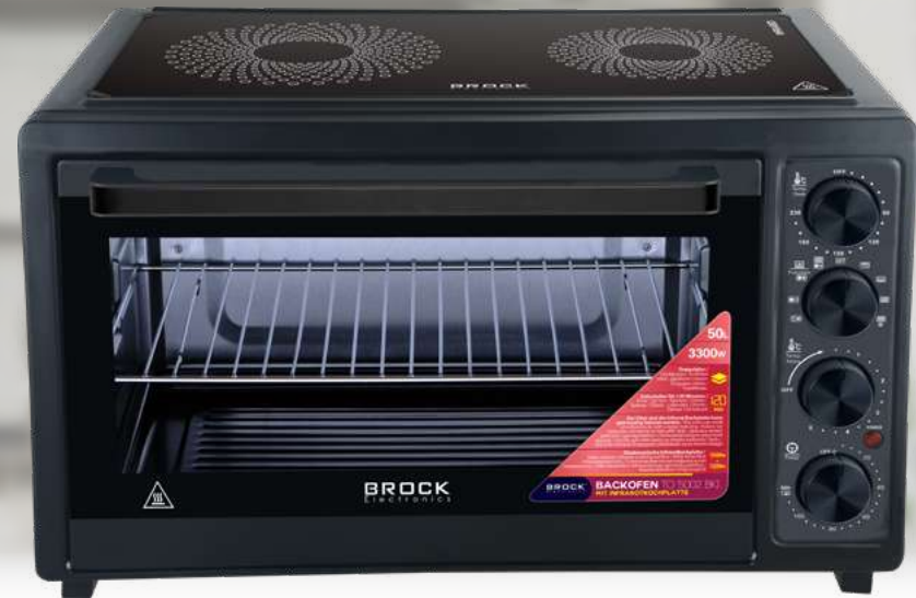
TO 5002 BK1

Volume : 35L | Oven Power: 1500W | Big hob Power: 1500W | Small hob Power:1200W | 90-230°C temperature selector | Oven can work at the same time with the big hob | 9 types of function selector | 120 minutes timer |