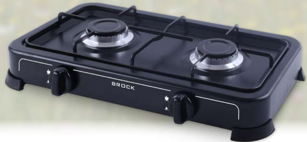
GS 2002 BK

Designed for outdoor use only | Comfortable stove for picnics in nature | Works with G30 butane (28-30 mbar) and G31 propane (37mbar) gas | LPG gas consumption | Qualitative cast iron burners | Durable iron body | Location: table or similar, stable, horizontal surface |