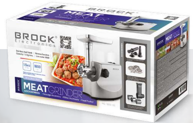
MG 1800 SS

Volume: 1,5 kg/min | Power: 1800 W | Stainless steel blade | Stainless steel square tray | Exchangeable 3 stainless steel cutting plates: 3mm, 5mm, 7mm | Stainless steel cutter and vegetable cutter attachment with 3 cutters | Reverse function | Anti-Slip feet | Low noise: 90dB | Accessories: Sausage accessory, Kibbe accessory, Food pusher |