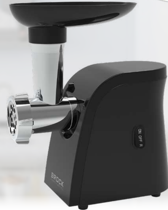
MG 1503 BK

Maximum Power: 1500W; 220~240V/50Hz | VDE plug | Black power cord | Total length 120cm | Stainless steel blade | 3 pcs metal cutting plates (hole size: 3mm, 5mm, 7mm). | Accessories: 1 PP pusher, 1 sausage adapter, 1 kubbe attachment |