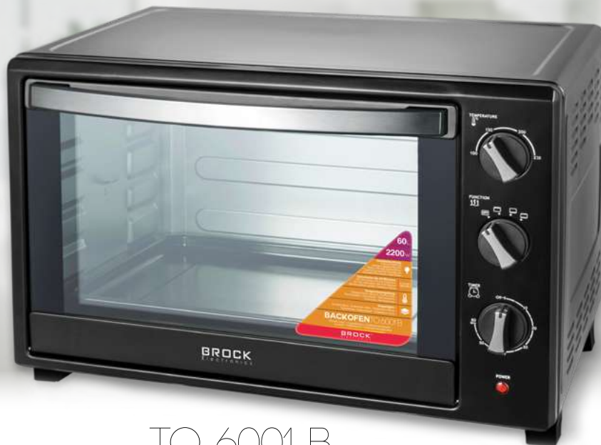
TO 6001 B

Volume: 60L | Power: 1500W; 220-240V, 50/60Hz | Stainless steel heating element | 60 min timer with alarm | Thermostat 100-230°C. Heating functions: Off / Heating from top / Heating from bottom / Heating from top and bottom | The large interior lighting | Double glass | Convection function | Stainless steel handle | Accessories: Baking tray, Wire rack, Tray handle |