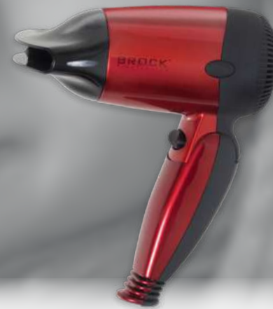
HD 8901 RD