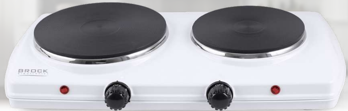
EP 2000 WH

Power: 1500 W; 220-240 V, 50/60 Hz | Hotplate with a diameter of 18.5 cm | Ideal for college dorms, cottages or camping | Indicator light | Protection against overheating | Anti-Slip feet |