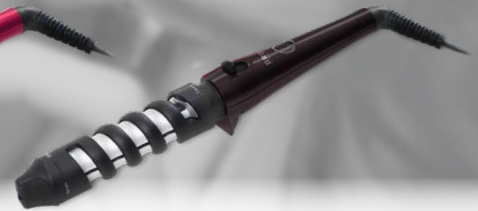
HC 6201 VT

Power: 40W | Max temperature: 200°C | Two sizes in one styler | Unique twin pressure spiral system (19mm or 32mm) for perfect clamping and curling of hair | Ceramic coating | PTC heating element heats up quickly and maintains a constant temperature | 60 second heat up time | Cool tip | Ready indicator light | 360° swivel power cord |