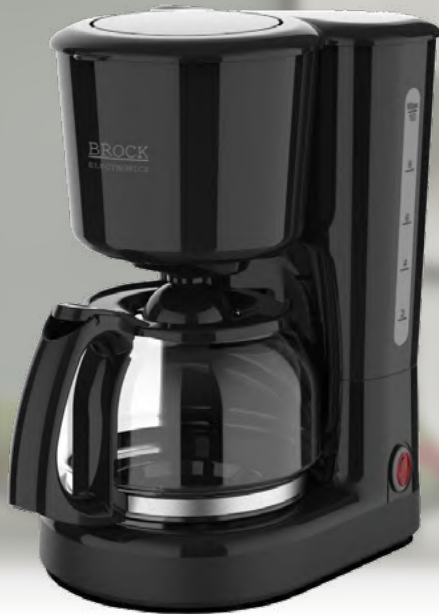
CM 1250 BK