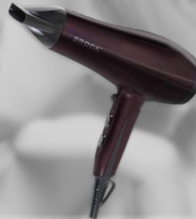
HD 8201 VT