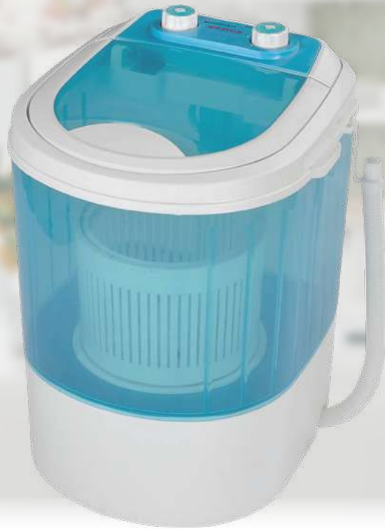
WM 3001 WH

Power: 300W | Max Capacity: 3kg | Mechanical control | 10 minutes wash timer | Spin function | Plastic body | Ecological & Safe and economical | Quiet operation | Ideal for long trips, camping or use at home due to it's small and compact size |