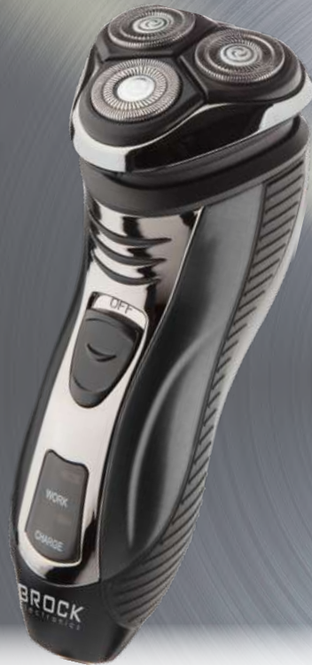
BMS 2001 BK

Power source: Battery | Pop-up beard Trimmer on the back | Triple-heads, double floating system | Wet / Dry operation | Operating time: 80 minutes | Accessories: Protection cap, Cleaning brush, Charging adaptor |