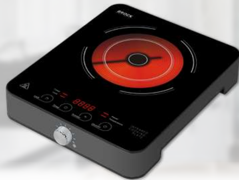
HPI 1001 GY

Power: 1800W | Single-zone | Suitable for cookware with a diameter up to 20cm | Touch sensor control | Extra durable & Easy to clean ceramic crystal glass surface | Temperature setting range: 50 - 500°C | Large LED display | Hot surface warning | Flexible timer |