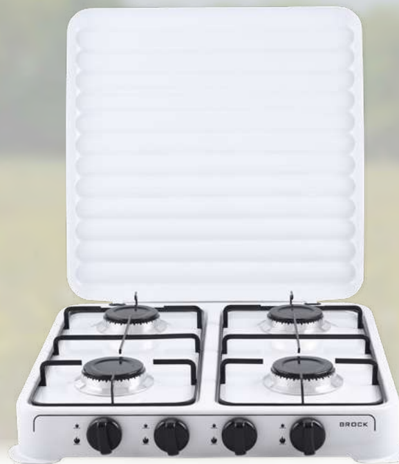
GS 004 W