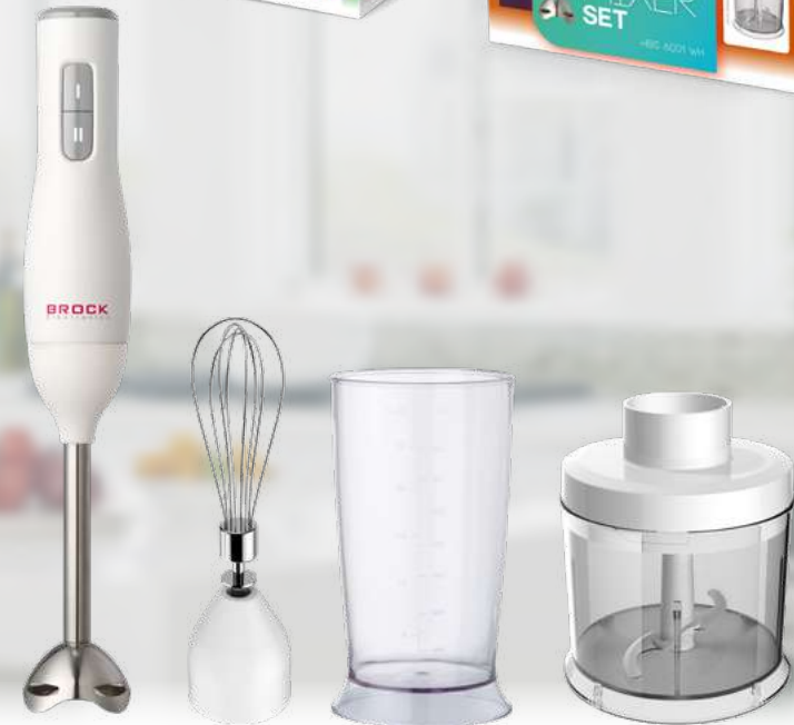
HBS 6001 WH

Power: 300W | Hand Blender Set | 2 speeds switch | Detachable stainless steel mixing rod | Stainless steel whisk | Stainless steel blade | Accessories: 700ml blending cup | 500ml chopper |