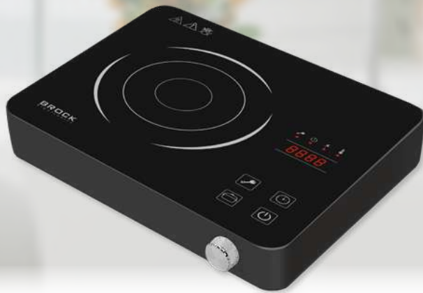
HP 2021 GY

Power: 1800W | Single-zone induction cooktop | Suitable for cookware with a diameter up to 26 cm |