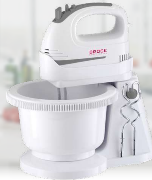
HMB 3009 WH

Power: 300W | 5 speeds | TURBO function | Eject button for releasing attachments | With stainless steel beaters and hooks |