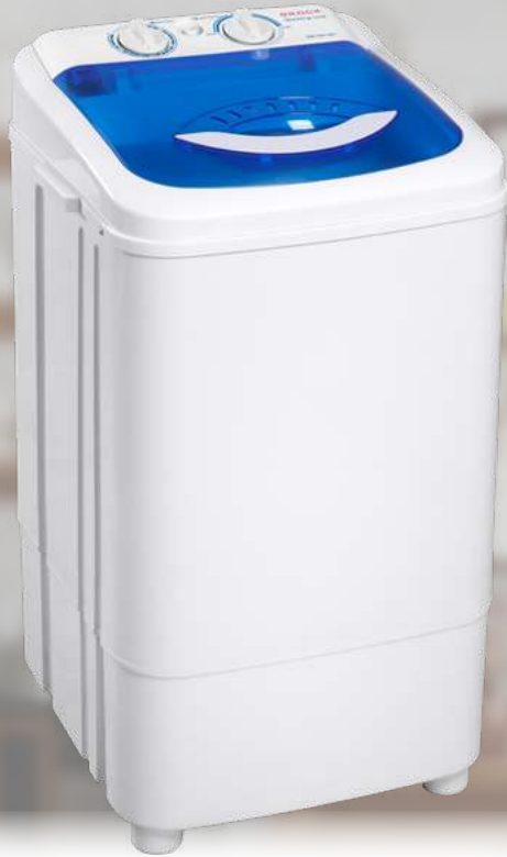
WM 7001 WH

Power: 300W (wash) | Max Capacity: 6.8 kg | Mechanical control 15 minutes wash timer | Plastic body | Quiet operation | Ecological & Safe and economical | IPX4 |