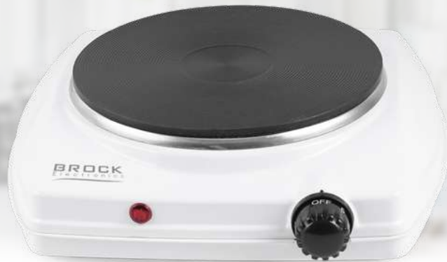
EP 1500 WH

Power: 1500 W; 220-240 V, 50/60 Hz | Hotplate with a diameter of 18.5 cm | Ideal for college dorms, cottages or camping | Indicator light | Protection against overheating | Anti-Slip feet |