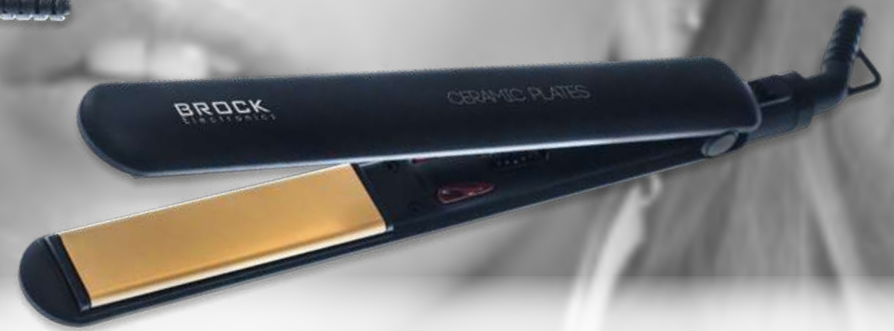
HS 5002 BK

Floating ironing surfaces | On / Off switch | 360° swivel power cord | Power cord length 1,8m | Hanging loop | Integrated lock for securing the iron in the locked position for easy storage |