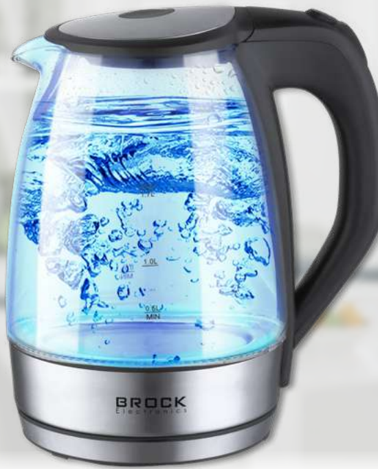
WK 2105 BK