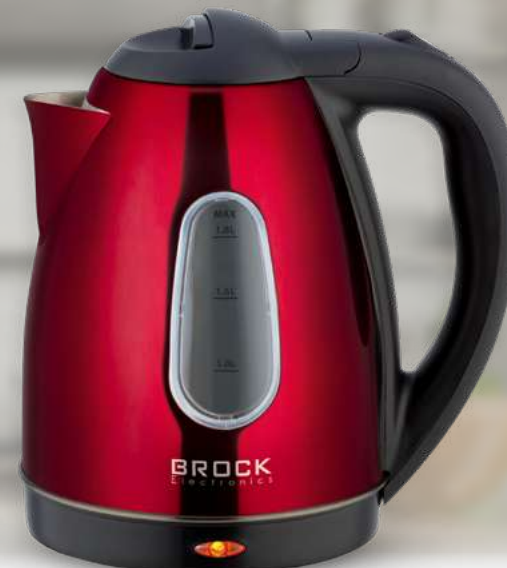
WK 0603 RD

Volume: 1,8L | Power: 1500W | Stainless steel body | Water level mark. Red indicator light | Triple safety system: Protection against overheating when turned on without water, Automatic Shut-Off when removed from the base, Automatic Shut-Off when boiling point is reached | Sunlight controller | Length of the power cord: 0,75m |